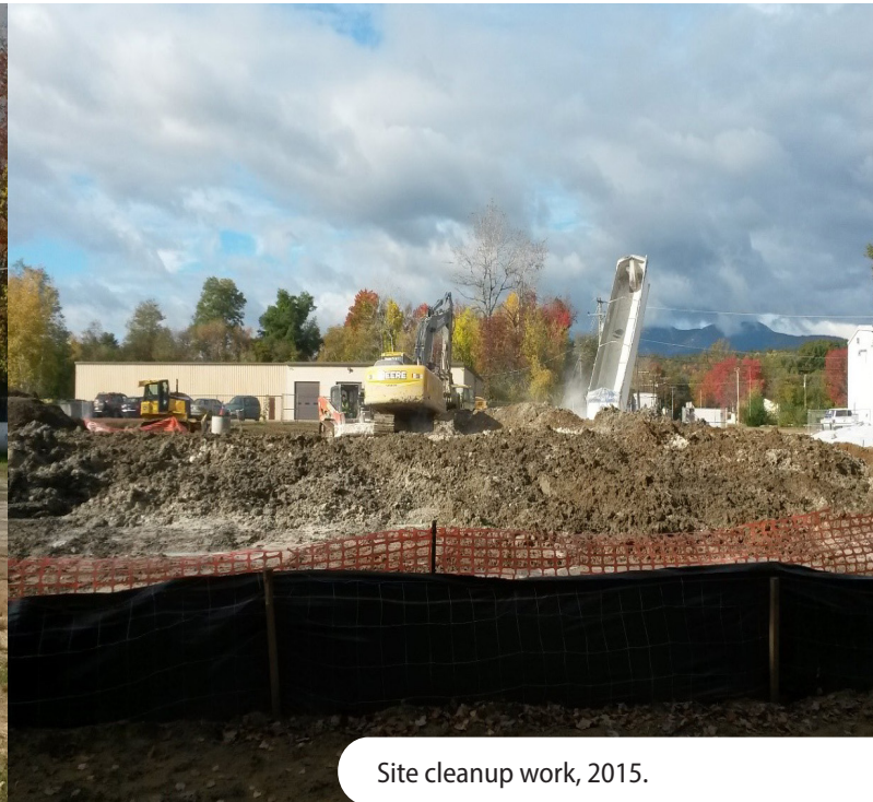
Site cleanup work, 2015.