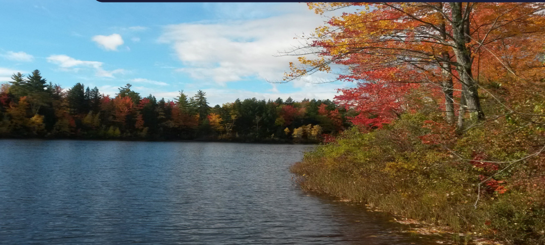
The north bank of Pequawket Pond, 2016.

For more information see: www.epa.gov/superfund-redevelopment