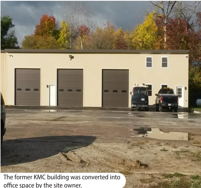
The former KMC building was converted into office space by the site owner.

The New Hampshire Department of Environmental Services (NHDES) and EPA worked with KMC to remove wastes and restore groundwater. KMC led some cleanup efforts before abandoning the site and declaring bankruptcy in 1984. In 1992, EPA removed more than 13,000 tons of hazardous and solid waste from the site. In 1993, EPA built a groundwater pump-and-treat system. EPA and NHDES removed an additional 5,670 tons of contaminated soil in 2003. In 2012, EPA updated the groundwater remedy to natural attenuation. After this change, the town of Conway acquired the site through a tax deed. EPA then transferred the groundwater treatment plant to the town of Conway. NHDES will monitor groundwater until EPA takes the site off the NPL. In 2015, NHDES led additional cleanup, mixing an oxidizing compound into a 1-acre area where additional soil contamination was found. NHDES established native plants in the treatment zone and finished restoration work in the spring of 2016.