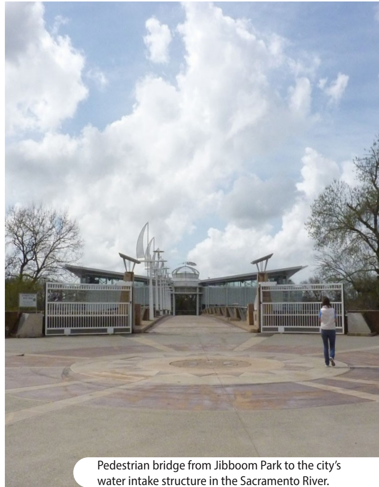
Pedestrian bridge from Jibboom Park to the city's water intake structure in the Sacramento River.