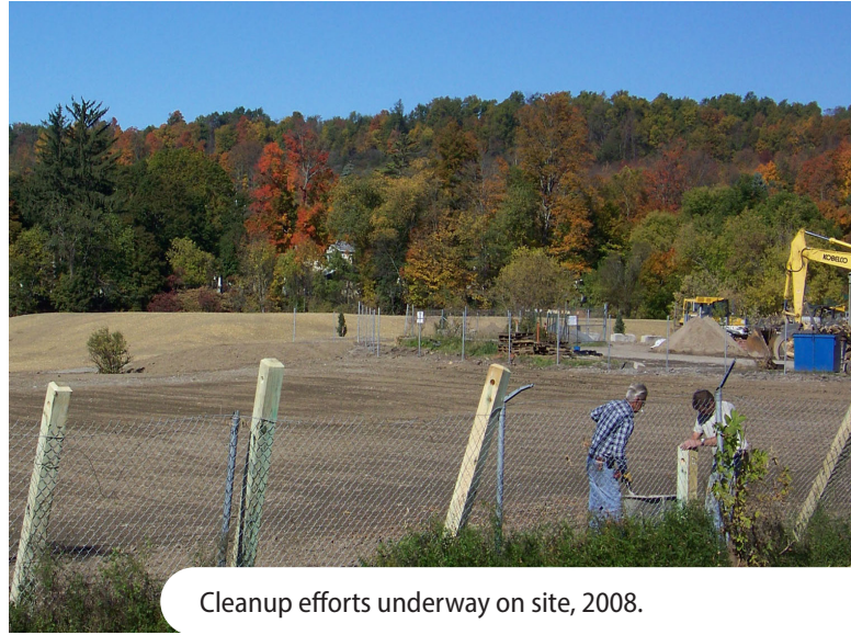
Cleanup efforts underway on site, 2008.

With the expectation of one day reclaiming the property, the local government requested a pilot grant from EPA's Superfund Redevelopment Initiative. After EPA awarded the grant in 2001, the community used it to develop a Reuse Assessment Plan. The Plan incorporated extensive input from all parts of the community. Its recommendations focused on opportunities for public, recreational and commercial uses at the site.