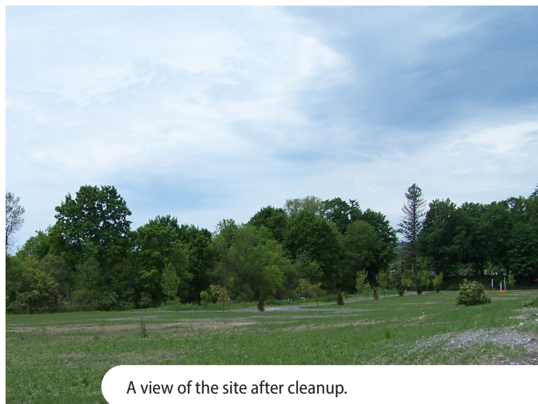
A view of the site after cleanup.