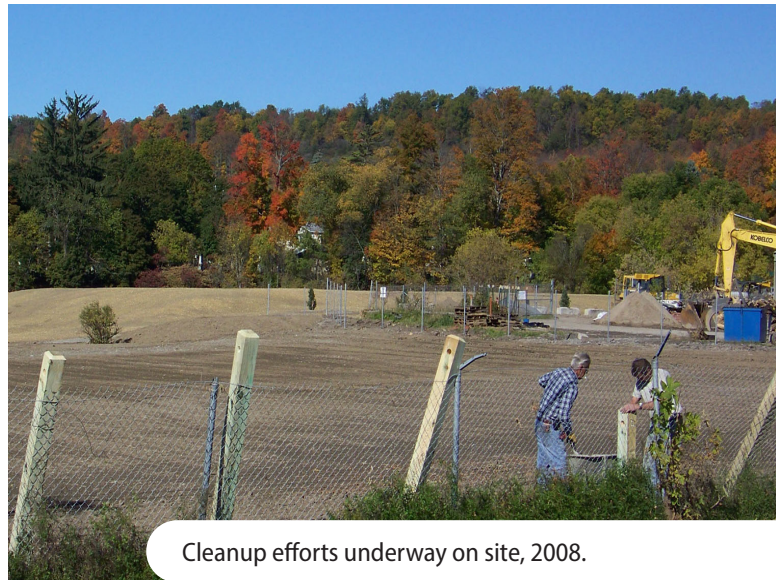
Cleanup efforts underway on site, 2008.

With the expectation of one day reclaiming the property, the local government requested a pilot grant from EPA's Superfund Redevelopment Initiative. After EPA awarded the grant in 2001, the community used it to develop a Reuse Assessment Plan. The Plan incorporated extensive input from all parts of the community. Its recommendations focused on opportunities for public, recreational and commercial uses at the site.