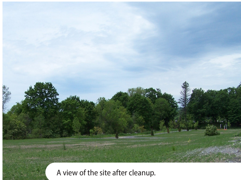
A view of the site after cleanup.