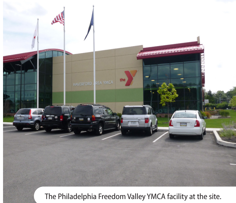
The Philadelphia Freedom Valley YMCA facility at the site.

Over time, the revitalization of the site has continued, returning the land to productive reuse. The site supports five businesses, including the YMCA, a physical therapy clinic, a grocery store, a restaurant and a storage facility. In 2018, these businesses employed over 400 people and generated an estimated $9 million in annual sales.