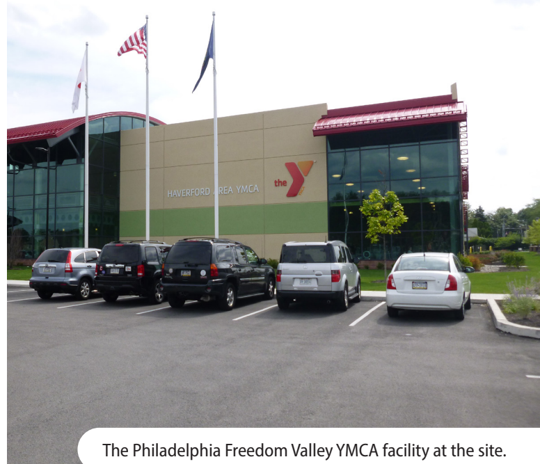
The Philadelphia Freedom Valley YMCA facility at the site.

Over time, the revitalization of the site has continued, returning the land to productive reuse. The site supports five businesses, including the YMCA, a physical therapy clinic, a grocery store, a restaurant and a storage facility. In 2018, these businesses employed over 400 people and generated an estimated $9 million in annual sales.