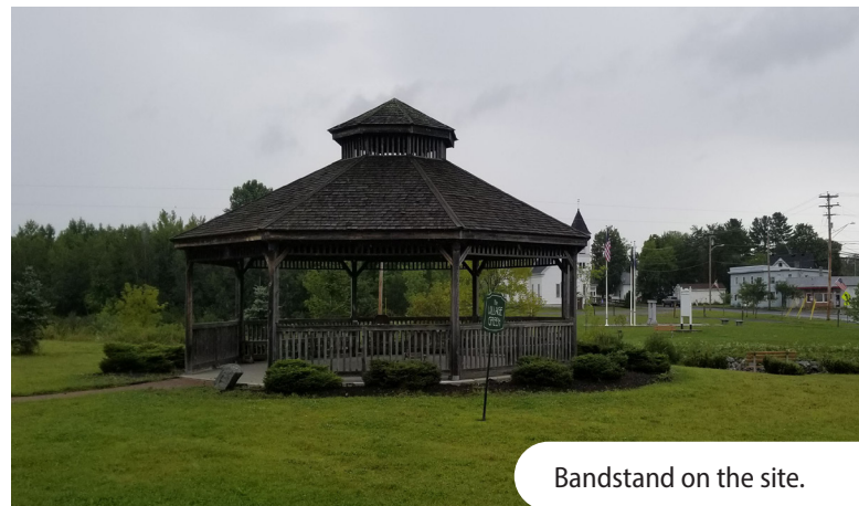
Bandstand on the site.