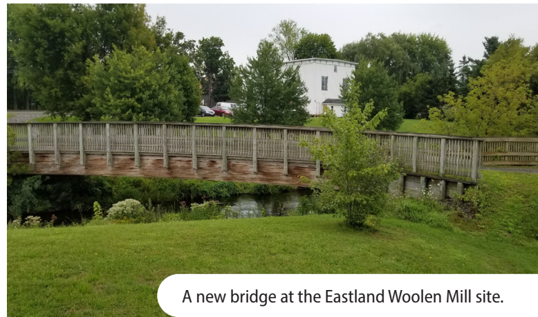
A new bridge at the Eastland Woolen Mill site.

Today, a 20-unit senior housing facility is located on part of the site. EPA, the Corinna town government and state agencies worked to relocate the historic Odd Fellows Building off the site; a country store and restaurant are now located in it. A plan for a village-style subdivision and greenspace along the river was approved in 2006. In 2008, a bandstand and boardwalk were built on site. In 2012, EPA took 80 percent of the site's land area off the NPL. The site's transformation is a testament to the power of collaboration and the vital role of reuse planning in supporting long-term community revitalization efforts.