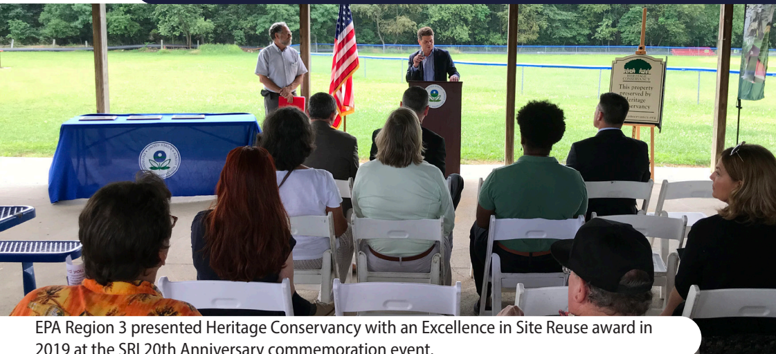
EPA Region 3 presented Heritage Conservancy with an Excellence in Site Reuse award in 2019 at the SRI 20th Anniversary commemoration event.

For more information see: www.epa.gov/superfund-redevelopment