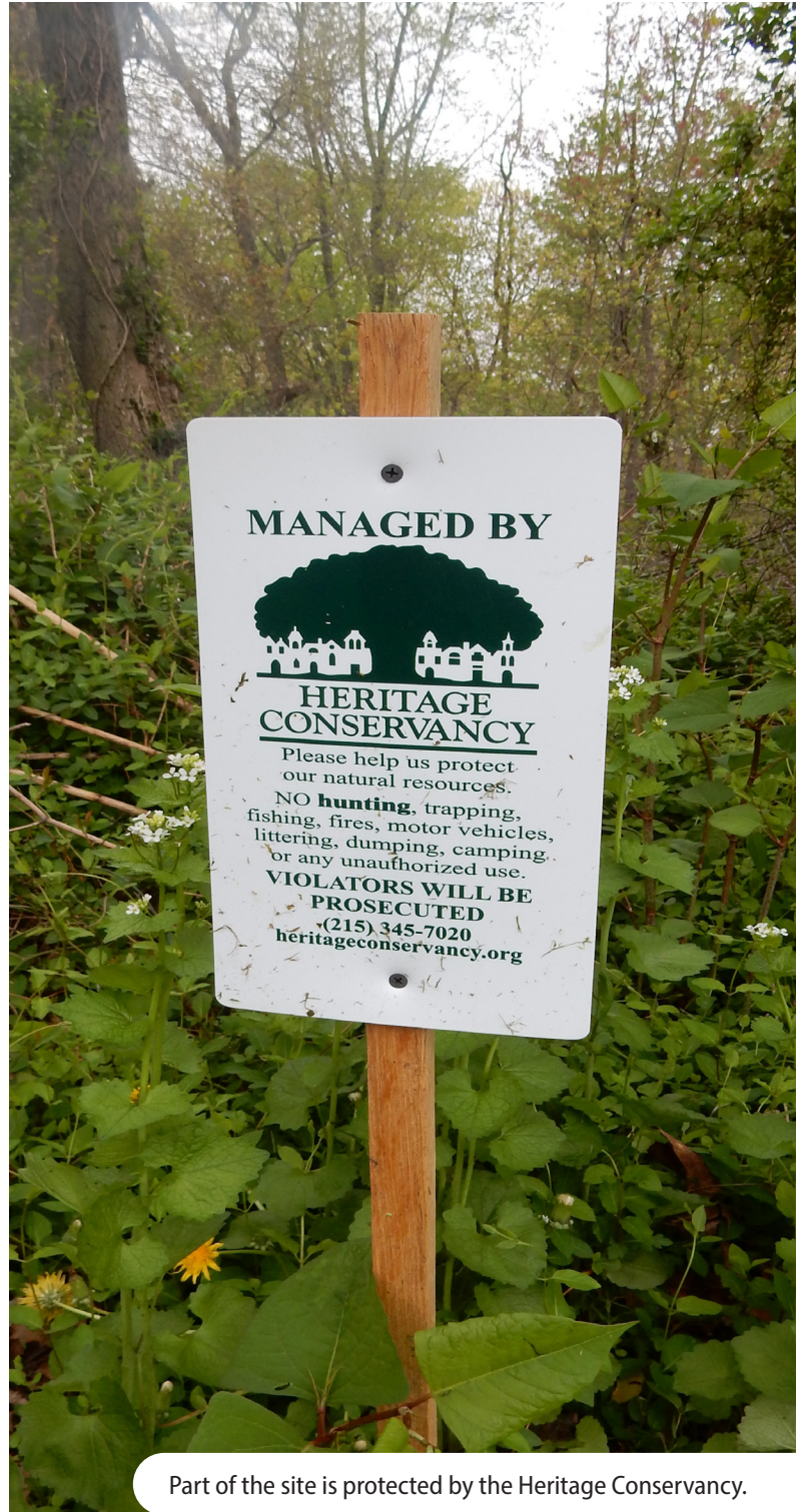
Part of the site is protected by the Heritage Conservancy.

EPA issued two Records of Decision (RODs) to outline the cleanup strategy for the site. The 1988 ROD addressed OU1 by connecting homes within the plume to the Borough of Bristol Water and Sewage Department water supply. The 1990 ROD for OU2 selected groundwater extraction and treatment to contain contamination and restore groundwater quality. Cleanup at the site began in 1989. Construction of the OU2 groundwater extraction and treatment system was completed in 1996. Groundwater cleanup is ongoing.