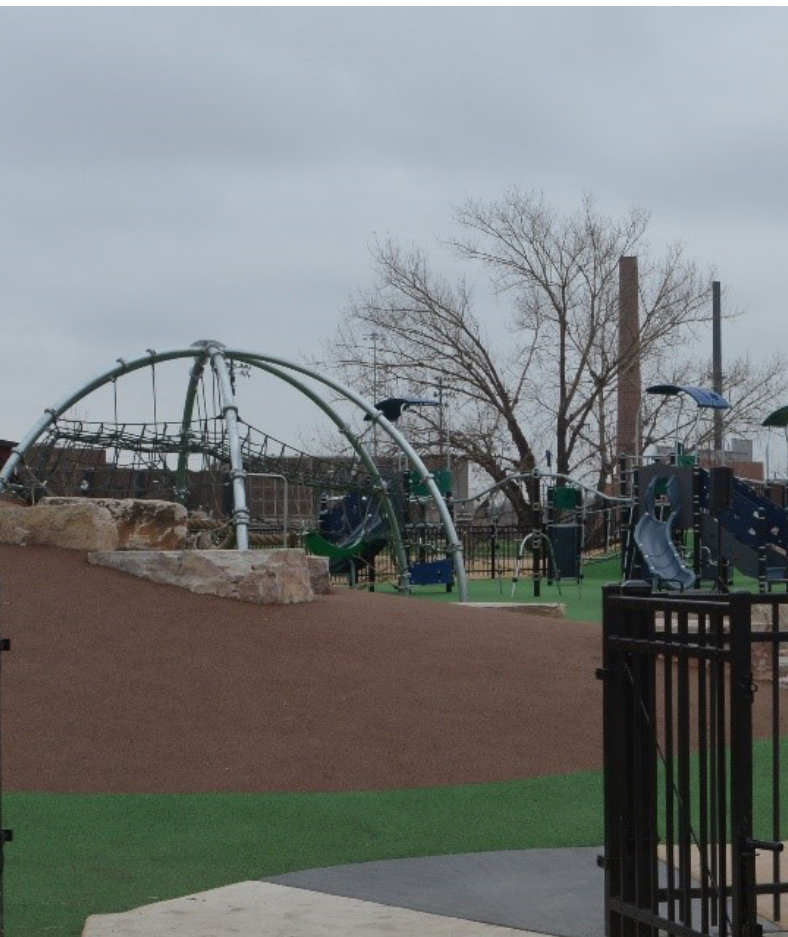
One of the playgrounds at La Villita Park.