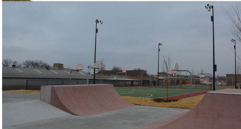
A skate park at the site.

For more information see: www.epa.gov/superfund-redevelopment