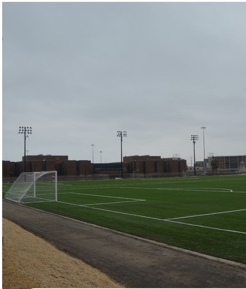
Soccer fields at the site.

“The thousands of families living in the surrounding area now have a place to come together as a community to exercise, play and be active for years to come.”