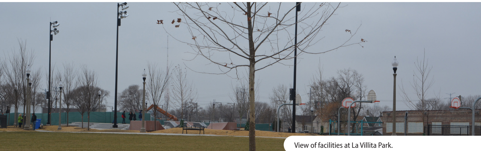
View of facilities at La Villita Park.

With the site's remedy in place, attention shifted to potential redevelopment opportunities. The city of Chicago, the Chicago Park District (CPD) and community organizations such as the Little Village Environmental Justice Organization (LVEJO) prioritized the area's reuse as a community resource. To address potential Superfund liability issues for the locality, EPA developed a Prospective Purchaser Agreement, or PPA.