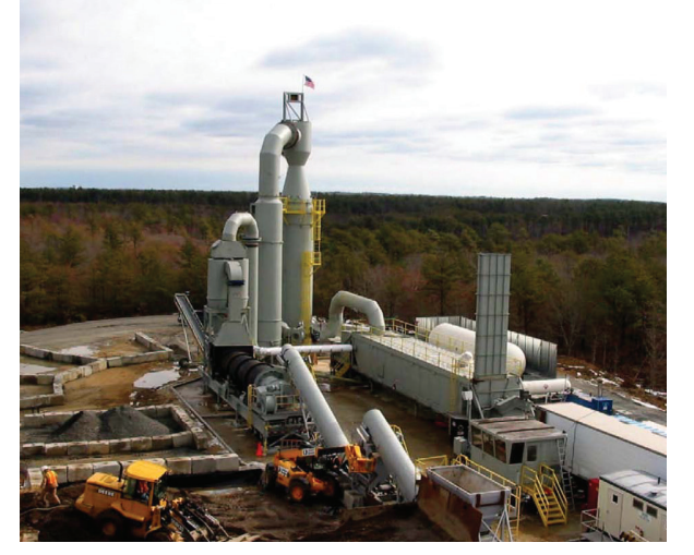
Onsite thermal desorber.

Thermal desorption may be faster and provide better cleanup than other methods, particularly at sites that have high concentrations of contaminants. A faster cleanup may be important if a contaminated site poses a threat to the community or needs to be cleaned up quickly so that it can be reused. Thermal desorption has been selected for use at dozens of Superfund sites and other cleanup sites across the country.