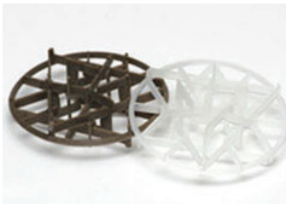
Sample plastic packing material.

Air stripping is an effective way of removing VOCs from contaminated water and is commonly used as part of groundwater pump and treat systems at sites around the country. Air strippers can be brought to the site, avoiding the need to transport contaminated water for offsite treatment. Air stripping has been selected for use at hundreds of Superfund sites and other types of sites across the country.