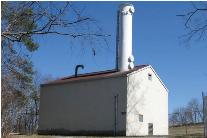
Air stripper and treatment building.

Air stripping treatment generally will not disrupt your community. Initial construction of the treatment system will require use of trucks and heavy machinery. You may see a temporary increase in truck traffic as equipment comes to the site for construction. Air stripping systems are not particularly noisy when running, however.