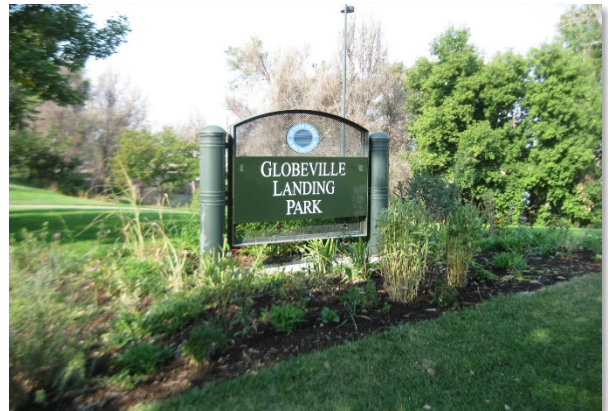
Figure 6. Globeville Landing Park.