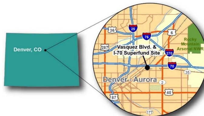
Figure 1. The site's location in Denver, Denver County, Colorado.