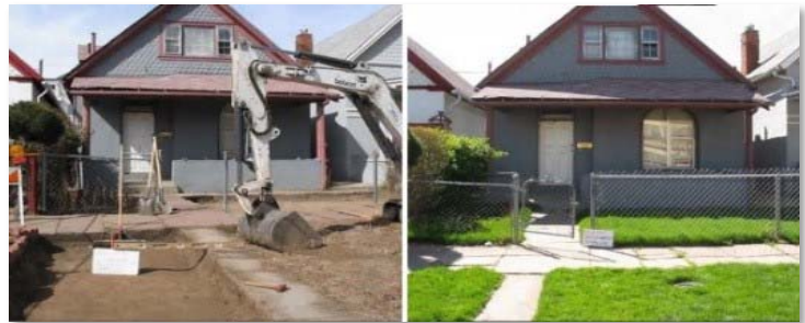
Figure 2. Before-and-after views of the residential soil cleanup.

EPA selected the final remedy for OU1 in 2003. Final cleanup plans for OU2 and OU3 are under development. As part of developing the OU1 remedy, EPA worked with community members to make sure the remedy addressed local concerns. EPA twice awarded a technical assistance grant to the Cole, Clayton, Swansea, Elyria Environmental Coalition, a local community group, whose members came together to participate in the cleanup process. EPA staff also presented at neighborhood organization meetings, community fairs and picnics, public meetings, and other local gatherings. During this time, EPA sampled more than 4,000 residential properties and identified nearly 800 properties across six neighborhoods that required cleanup.