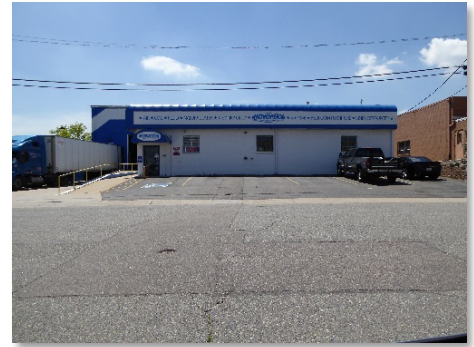
Figure 11. Innomax Corporation.