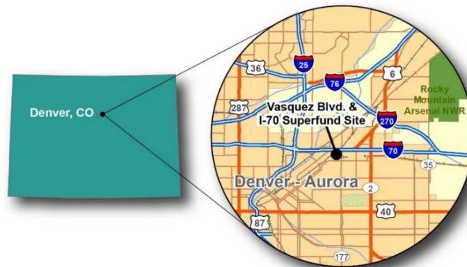
Figure 1. The site’s location in Denver, Denver County, Colorado.