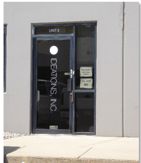
Figure 13. Ideations, Inc.