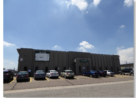
Figure 14. The building at 4785 Elati Street that holds several on-site buildings.

The VB/I-70 Superfund site illustrates how Superfund cleanup and redevelopment can provide multiple benefits to a wide range of community stakeholders. The successful cleanup protects public health and the environment, while allowing businesses to remain open and people to remain in their homes. Continued uses and redevelopment help to sustain and grow the local economy, while raising property values and generating tax revenues that fund vital public services. These efforts have also brought together diverse groups – EPA, state agencies, the City and County of Denver, community organizations, property owners and potentially responsible parties. At Superfund sites across the country, such collaborative relationships help ensure the protectiveness and stewardship of site remedies as well as communities' economic vitality over the long term.