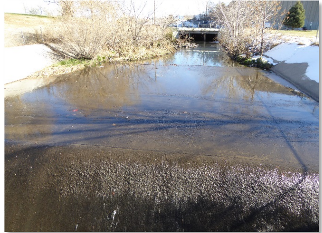
Figure 3. Current drainage channel in place.

EPA is coordinating with the City and County of Denver so that infrastructure improvements within the VB/I-70 site are conducted in a way that meets both the goals of redevelopment and protection of human health and the environment. The City funded a drainage project aimed at flood mitigation and better stormwater drainage for the Elyria, Swansea, Cole, Clayton and Globeville neighborhoods. It will protect residents from 100-year storm events through two systems of new storm drain pipes, detention ponds and open channels, ultimately draining to the South Platte River. The project will also provide for more natural habitat and recreation in the area.