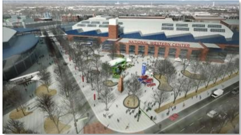
Figure 4. Proposed redevelopment plans for the Complex.

The City of Denver also plans to expand the already existing Regional Transportation District commuter and light rail system through the FasTracks program, a multibillion dollar comprehensive transit expansion plan to build 122 miles of new rail lines, 18 miles of bus rapid transit and 21,000 new parking spaces at light rail and bus stations. At least three of the proposed rail lines – the East Rail Line, the North Metro Line and the Northwest Line – will pass through parts of the site. The City hopes the program will address traffic congestion while also expanding access to public transportation. The City has also developed the 2014 Transit Oriented Development Strategic Plan to provide a foundation to guide public and private investment at rail stations. With several stations proposed within the site’s boundaries, the plan could foster additional development initiatives in the area.