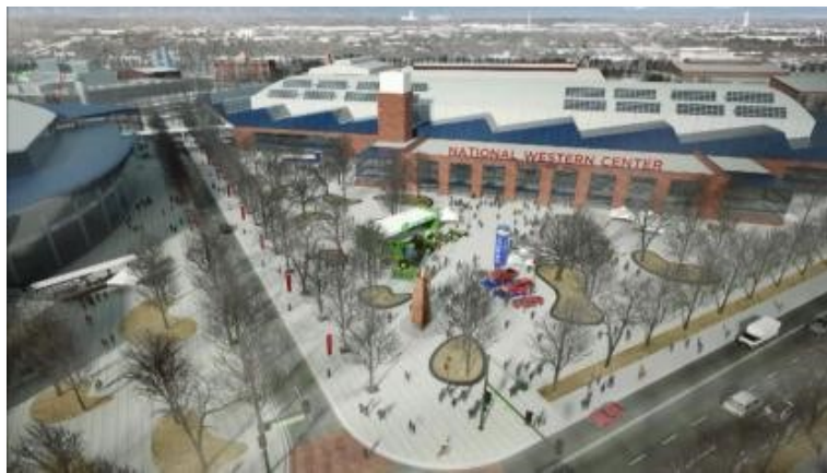
Figure 4. Proposed redevelopment plans for the Complex.

The City of Denver also plans to expand the already existing Regional Transportation District commuter and light rail system through the FasTracks program, a multibillion dollar comprehensive transit expansion plan to build 122 miles of new rail lines, 18 miles of bus rapid transit and 21,000 new parking spaces at light rail and bus stations. At least three of the proposed rail lines – the East Rail Line, the North Metro Line and the Northwest Line – will pass through parts of the site. The City hopes the program will address traffic congestion while also expanding access to public transportation. The City has also developed the 2014 Transit Oriented Development Strategic Plan to provide a foundation to guide public and private investment at rail stations. With several stations proposed within the site’s boundaries, the plan could foster additional development initiatives in the area.