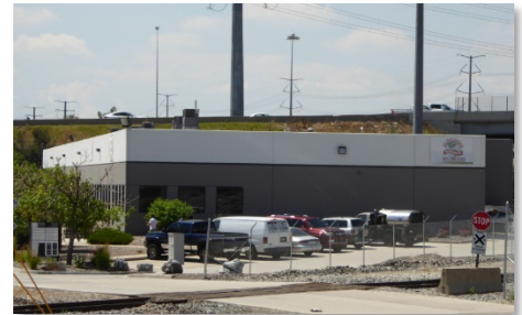
Figure 12. Maintenance Resources.