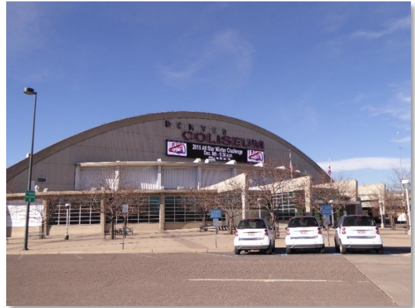
Figure 5. Denver Coliseum.

OU3, the former location of the Argo smelter, is now home to a wide variety of businesses, including a hotel, a newspaper publisher, restaurants and a furniture wholesale company. One business – Victory Construction and Refrigeration Inc., a plumbing, heating and air conditioning contractor – provides nearly $3 million in estimated annual employee income. In total, OU3 includes 39 businesses and organizations. They provide nearly $28 million in estimated annual employee income. These businesses and organizations generated an estimated $75 million in total sales in 2016.