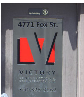
Figure 9. Victory Construction and Refrigeration, Inc.