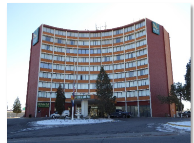
Figure 8. Quality Inn Denver.

This national hotel chain operates under the larger Choice Hotels International network. This Quality Inn provides nearly $220,000 in estimated annual employee income. Sales generated in 2016 were an estimated $290,000.