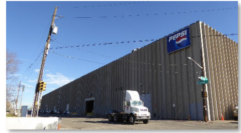
Figure 10. PepsiCo West.

On-site properties help generate property tax revenues that support local and state governments. In 2015, residential properties in OU1 and all properties in OU2 and OU3 generated nearly $10 million in estimated total tax revenues. These properties have an estimated current total property value of over $1.1 billion. On-site businesses that