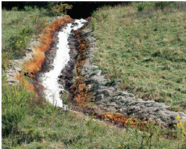
Untreated acid mine drainage in the Cheat River Watershed.