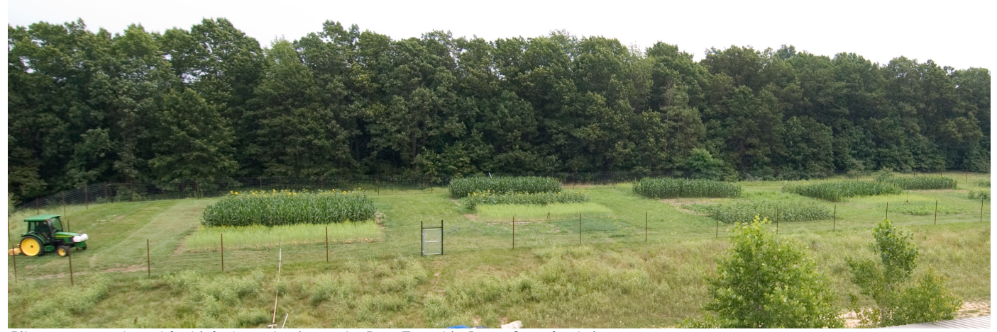
Pilot test crops planted for biofuels production at the Rose Township Dump Superfund site.