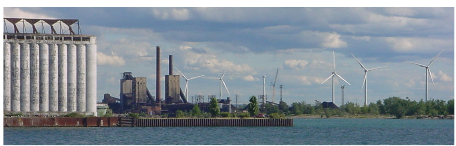
2.5-megawatt wind turbines at the Steel Winds project in Lackawanna, New York.