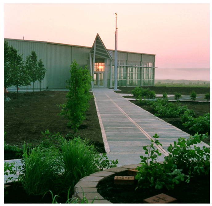
The site's warehouse prior to renovation (left), during renovation (above top) and in adaptive reuse as the Fernald Preserve visitor center (above bottom).