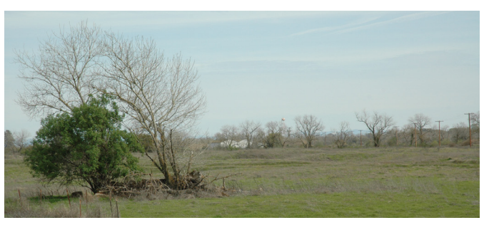
The Aerojet solar farm location prior to construction, 2009.

In 2008, for example, companies announced plans for two new solar plants that, according to The New York Times , will "generate more than 12 times as much electricity as the largest such plant today, the latest indication that solar energy is starting to achieve significant scale." The plants will cover 12.5 square miles and generate 800 megawatts of power on a sunny day, approximate to the scale of a large coal-burning power plant. Construction is scheduled to begin in 2011, with completion of the plants in 2014.