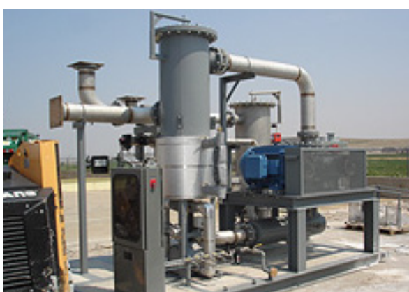
The plant at Lowry Landfill and an adjacent site will generate 3.2 megawatts of power annually.