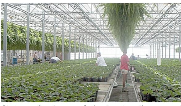
Plants growing in one of the largest methane-powered greenhouses in the United States.

The 508-acre Lowry Landfill outside Denver, Colorado, operated as a municipal landfill for several decades. Following the site's cleanup, the City of Denver, Waste Management and local utility Xcel Energy partnered to find a productive use for the site's landfill gas. In 2007, construction began on a landfill gas-to-energy plant at Lowry Landfill and the adjoining Denver Arapahoe Disposal site. The plant opened in September 2008; it uses four combustion engines to convert 630 million cubic feet of methane gas annually from both sites into 3.2 megawatts of electrical power, reducing greenhouse gases and providing electricity for approximately 3,000 households.