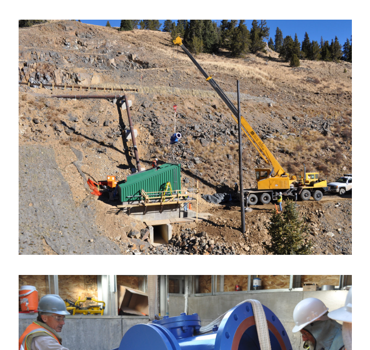
Installation of hydroelectric equipment at the Summitville Mine site in Colorado in 2010.

Examples of environmentally friendly technologies/ approaches include: recovering landfill gas for energy production; using renewable energy systems to power on-site treatment systems; purchasing construction materials with recycled or rapidly renewable content; using non-potable water for dust suppression; and promoting sustainable reuse of formerly contaminated lands.