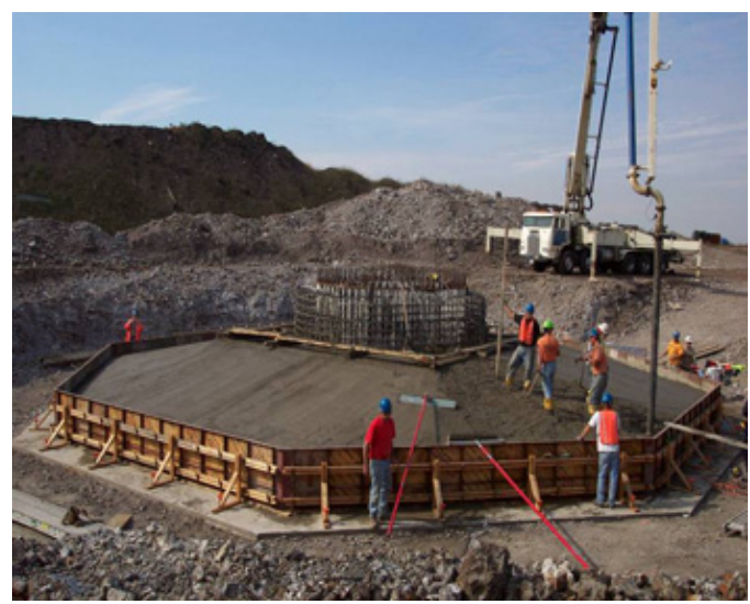
Construction of a wind turbine foundation for the Steel Winds project.

The City of Lackawanna, located on the shore of Lake Erie just south of Buffalo, was the center of steel production in the region during the early 20th century. Declining domestic demand for steel production and competitive global markets led to the plant closing its doors in the mid-1980s. Contamination from the steel plant's activities resulted in the facility's designation as a Superfund site.