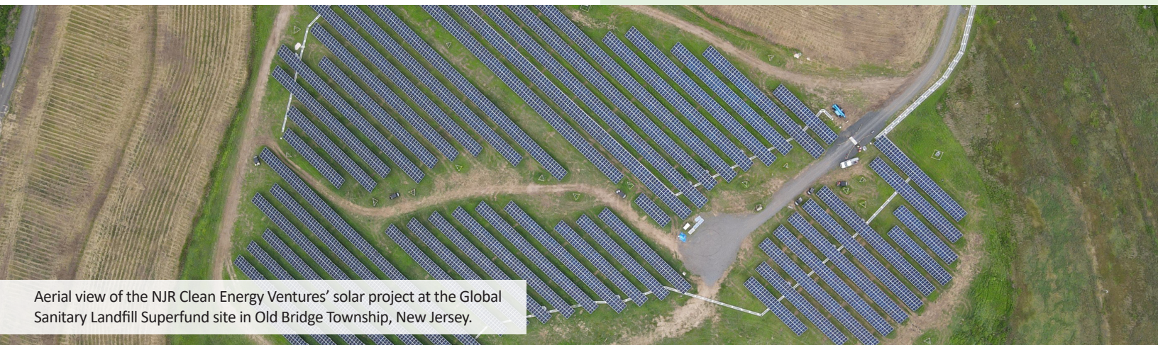
Aerial view of the NJR Clean Energy Ventures’ solar project at the Global Sanitary Landfill Superfund site in Old Bridge Township, New Jersey.

The site’s potentially responsible parties finished implementing the cleanup plans.