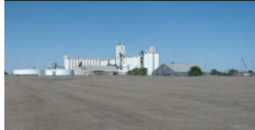
View of the site's capped area, looking west

Use Restrictions On-site groundwater, land use and dredging are restricted. Residential use is prohibited.