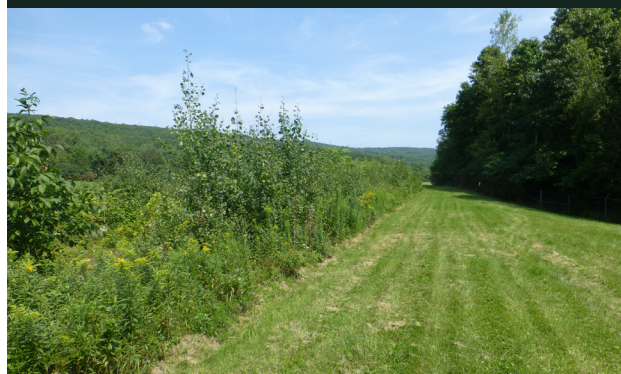
Woody vegetation and trees growing in gravel capped area

Use Restrictions Activities or redevelopment that would damage the capped and remediated areas are prohibited.