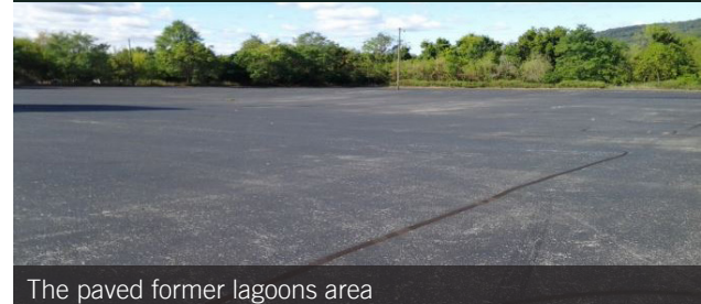
The paved former lagoons area

Use Restrictions An environmental covenant requires EPA approval for activities that may alter or damage the cap. Residential use and use of groundwater is prohibited.