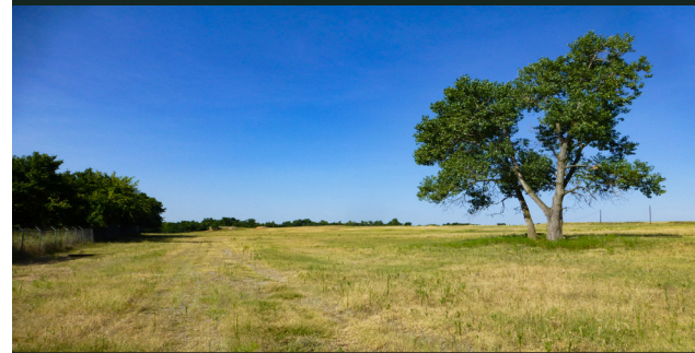
The site may be suitable for commercial and industrial uses

Use Restrictions Land use restrictions include deed restrictions on new wells and digging in capped areas. Future buildings will likely need measures to prevent vapor intrusion.