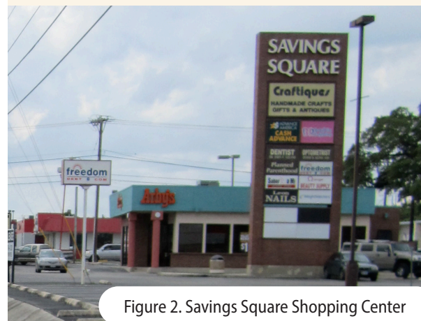
Figure 2. Savings Square Shopping Center

residences connected to public water supply