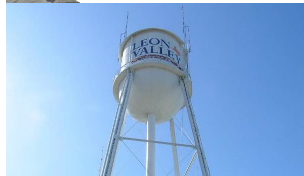
Figure 3. Leon Valley Municipal Water Supply tower