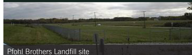
Pfohl Brothers Landfill site

Use Restrictions The use of groundwater, excavation activities that would impact the integrity of the cap and activities that would alter surface water drainage are prohibited. In uncapped areas that can be redeveloped, restrictions prohibit basements and require active or passive soil gas controls, surface water systems to convey water to existing systems and paved parking areas.