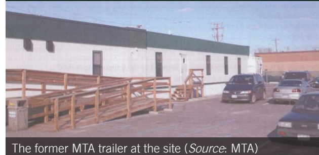
The former MTA trailer at the site

Use Restrictions EPA considers the site to be suitable for unlimited use and unrestricted exposure. However, if a building is constructed on the site in the future, additional sampling, evaluations and installation of a vapor mitigation system may be needed.