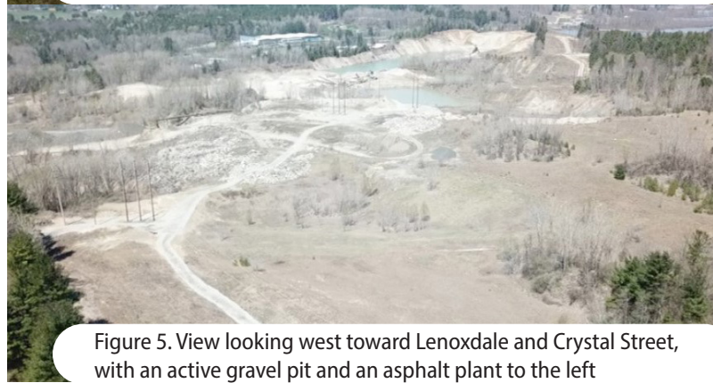
Figure 5. View looking west toward Lenoxdale and Crystal Street, with an active gravel pit and an asphalt plant to the left