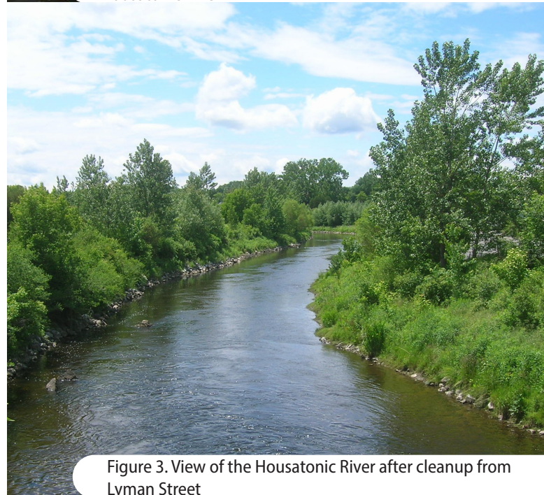
Figure 3. View of the Housatonic River after cleanup from Lyman Street