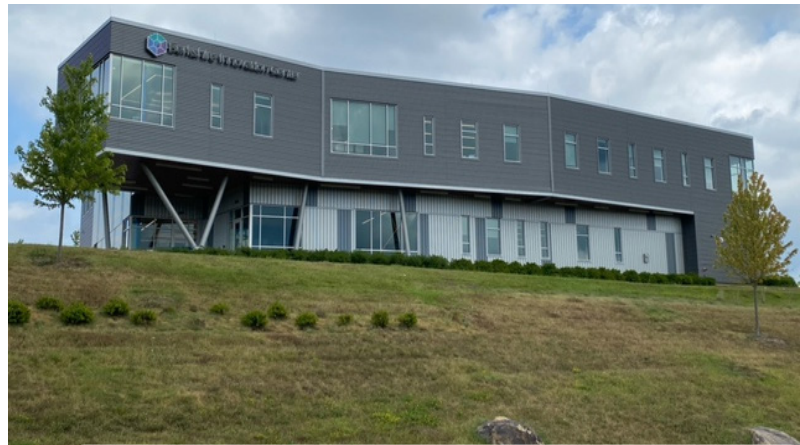
Figure 4. Berkshire Innovation Center opened on site in 2020

Collaboration with stakeholders and potentially responsible parties helped facilitate the beneficial reuse of the GE – Housatonic River site into a growing community asset. To ensure that future reuse is protective of human health and the environment, EPA will continue to work with site stakeholders to monitor remediated areas and plan for appropriate future uses.