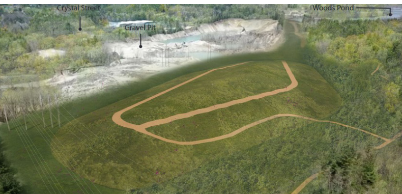
Figure 6. Concept design for an area near the active gravel pit and asphalt plant that includes walking trails and access to Woods Pond