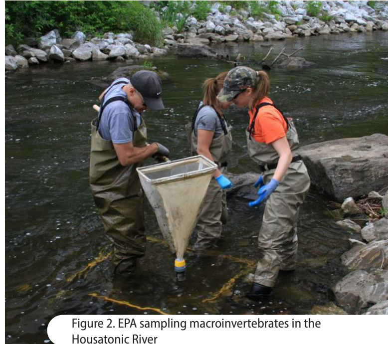
Figure 2. EPA sampling macroinvertebrates in the Housatonic River

1,000,000+ gallons of NAPL removed from groundwater