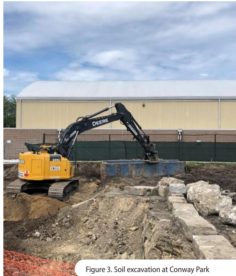
Figure 3. Soil excavation at Conway Park