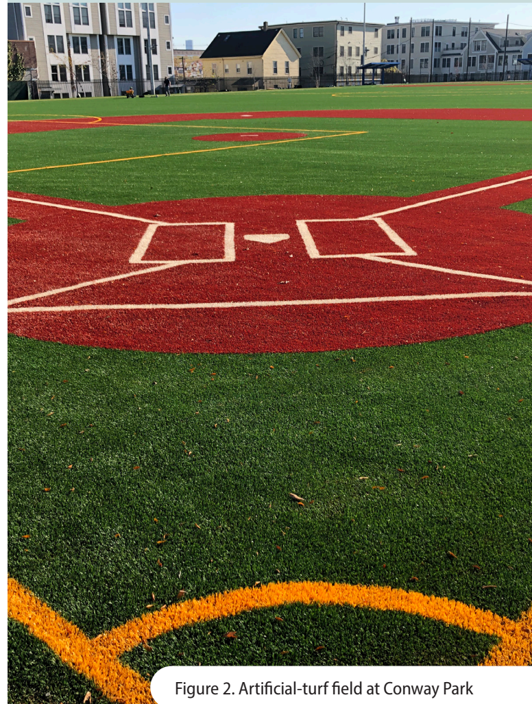
Figure 2. Artificial-turf field at Conway Park

EPA worked closely with the city of Somerville on a mixed-work approach. The phased plan divided cleanup costs and work between EPA and the city in order to efficiently eliminate the direct contact threat and source contamination in the highly used public recreation space.