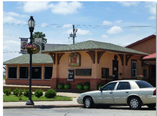
Figure 12. Mi Torito Mexican Restaurant in Galena, Kansas.