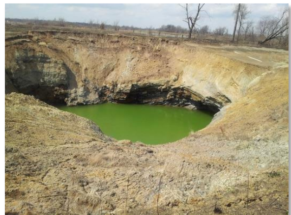
Figure 4. Subsidence caused by collapsed mine tunnel near Crestline, Kansas.