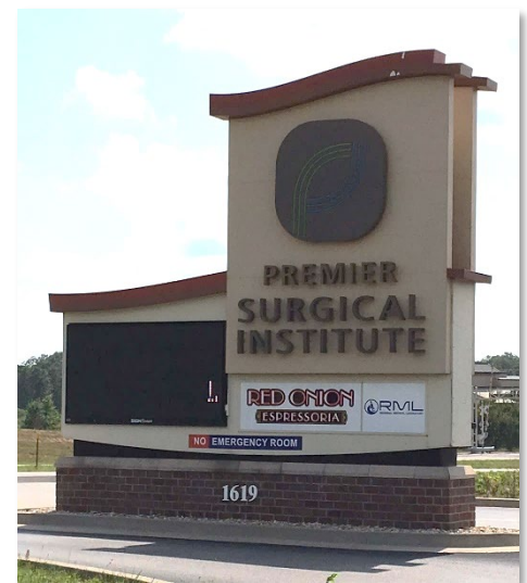
Figure 10. Premier Surgical Institute in Galena, Kansas.

This business, located in Baxter Springs, makes packaging products for the foodservice industry. In 2018, Bagcraft generated nearly $119 million in sales revenue and provided almost $18 million in estimated employee income.