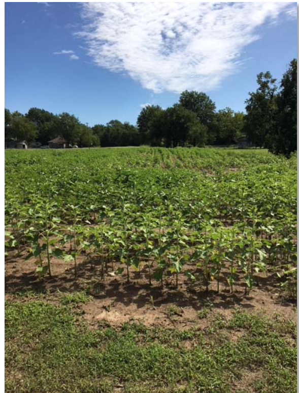
Figure 17. Sunflowers are now growing in this Baxter Springs neighborhood after EPA cleaned up lead contamination near a play area.

In Baxter Springs, high levels of lead were found in a residential area where children play. EPA cleaned up the area in 2017 by removing 2,400 cubic yards of mine waste. The city of Baxter Springs completed the lot's revival by planting sunflowers, adding aesthetic beauty to the neighborhood.