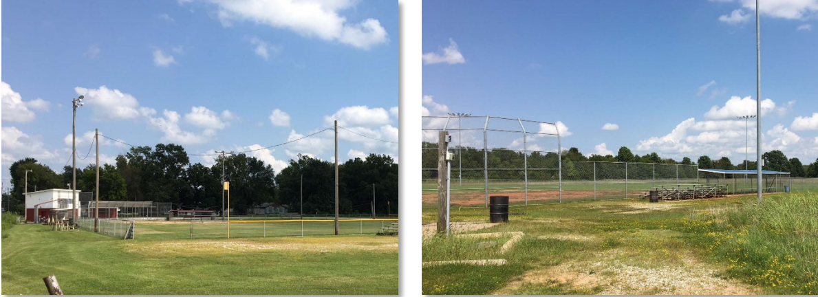
Figure 16. Two baseball parks built on cleaned-up areas in Baxter Springs.

Two cleanup areas in Baxter Springs have been redeveloped as separate two-field baseball parks. Figure 16 shows these parks; both were built on land cleaned up by responsible parties.