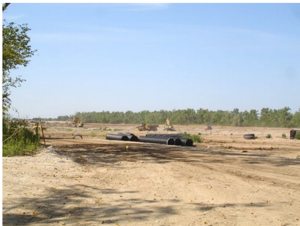
Figure 6. Cleanup in progress at the site.

To manage the cleanup, EPA divided the site into seven subsites: Galena, Baxter Springs, Treece, Badger, Lawton, Waco and Crestline. At the Galena subsite, EPA built a public water supply system in 1994 to provide a permanent source of clean drinking water to 1,500 people. A rural water district now operates the system. In 1995, EPA finished cleaning up mine waste on about 900 acres of non-residential land around Galena. The city of Galena had many residential yards that were contaminated with lead due to a smelter in the city. EPA tested more than 1,500 residential yards and cleaned up over 700 yards with high levels of lead or cadmium. The Galena yard cleanup was completed in 2001; about 180,000 cubic yards of residential soil were excavated, replaced with clean soil and revegetated. Land use controls are in place to guide future development in areas impacted by mining wastes. Restrictions are also in place to prevent people from using groundwater from the contaminated upper aquifer.