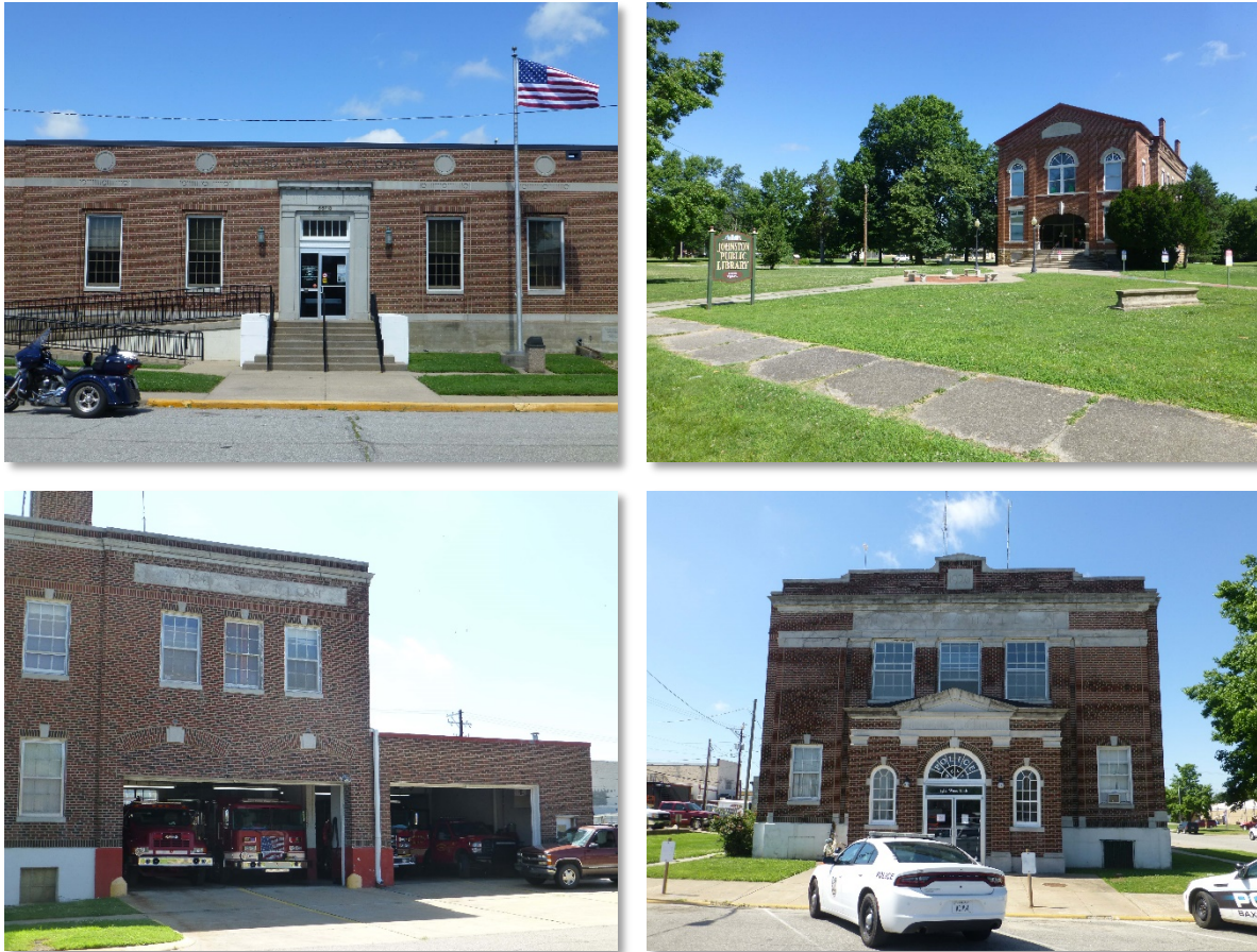
Figure 18. Clockwise from top left, continued public service uses in Baxter Springs include the post office, Johnston Public Library, and the community's police department and fire station.

A variety of public services have continued to operate at the site during the cleanup, including schools, post offices, libraries, police and fire stations, and public parks. These facilities employ over 300 people and provided over $10 million in estimated employee income in 2018. By enhancing the economic vitality of the area, the site's cleanup will indirectly support the continued strength of the area's community assets.