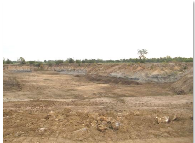
Figure 8. Cleanup in progress at the Sunflower Pit near Baxter Springs.

By transforming thousands of mine-scarred acres with contaminated yards and drinking water into a pastoral landscape of clean yards and safe drinking water, the site’s cleanup is directly and indirectly enhancing the economic vitality of the county and region. While it is outside the scope of this case study to quantify and monetize many of the cleanup’s indirect economic benefits, it is vital to emphasize the important role of the cleanup in revitalizing the area’s rural economy.