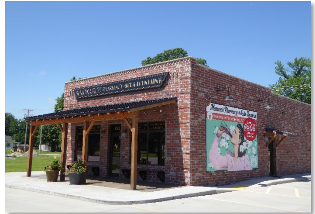
Figure 11. Monarch Pharmacy and Soda Fountain in Baxter Springs, Kansas.

This small firm provides accounting, tax and small business consulting services to the four-state area. In 2018, it generated over $140,000 in sales revenue.