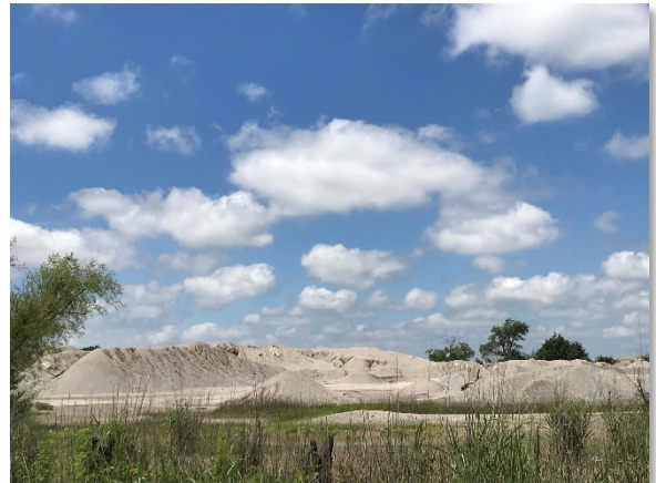
Figure 2. Chat pile in Treece, Kansas.

Starting in 1987, EPA began selecting plans for the site's long-term cleanup. Long-term cleanups began in 1989. The site's cleanup focuses on consolidation and disposal of mine wastes to reduce human and ecological exposures. EPA's goals at the site are to protect human health and the environment and support opportunities for ecological restoration and economic development. After nearly 35 years of work at the site, over 12 million cubic yards of mining waste and over 2,700 acres of land have been cleaned up, with most of the land reclaimed for agricultural use. EPA places the waste material in repositories, which are then covered with a clay