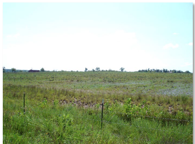
Figure 7. Vegetative cover established over cleaned up mine land.