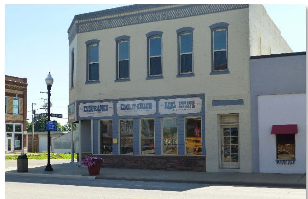
Figure 13. Kingrey-Kellum Insurance and Real Estate in Baxter Springs, Kansas.