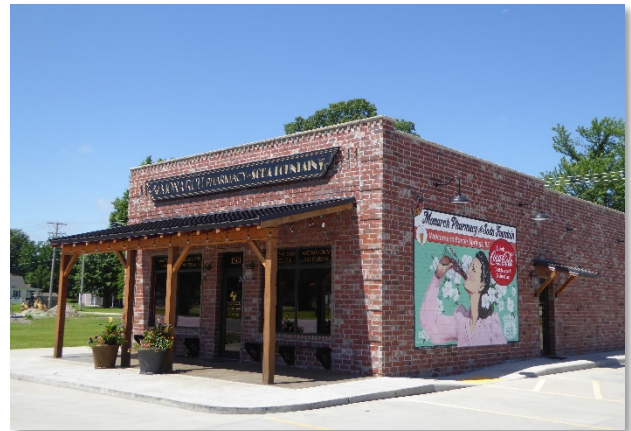
Figure 11. Monarch Pharmacy and Soda Fountain in Baxter Springs, Kansas.

This small firm provides accounting, tax and small business consulting services to the four-state area. In 2018, it generated over $140,000 in sales revenue.