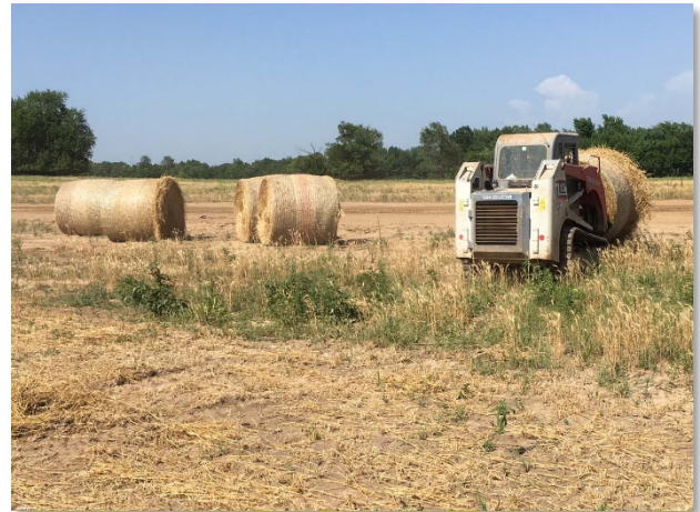
Figure 9. Wheat straw grown on cleaned-up land in Treece, Kansas.

Before its cleanup in 2017, this 12-acre area in Treece was barren land consisting mostly of waste rock. As EPA worked on plans to clean up the area, the landowner asked whether the land could be reclaimed for agricultural production, consistent with surrounding land uses. EPA supported this outcome and designed the area's cleanup accordingly. At no additional cost, EPA was able to demolish and bury a significant number of old mine structures and cover the area with topsoil. This allowed the landowner to plant the area with wheat in the fall of 2017 and soybeans in the spring of 2018. After decades sitting idle, this area is now productive agricultural land.