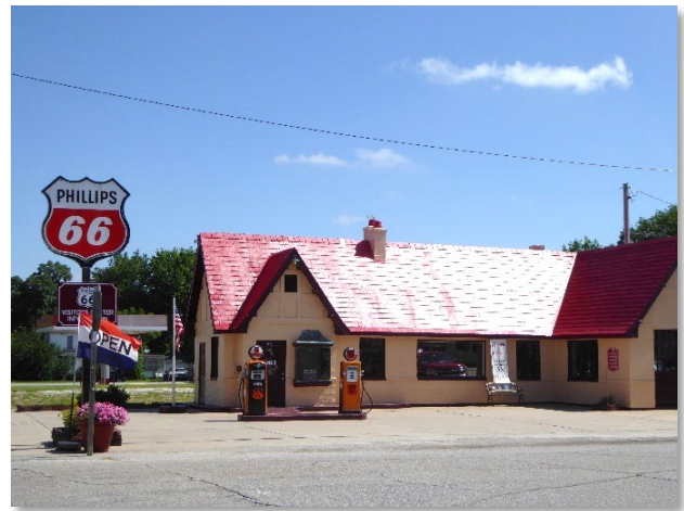
Figure 14. The Route 66 Visitors Center in Baxter Springs, Kansas.

In 2018, the largest car museum on Route 66 opened in downtown Baxter Springs. The museum features a rotating display of over 300 cars and motorcycles, from a Model T to vintage Corvettes and movie cars including Batmobiles and the "Back to the Future" DeLorean. The museum complex also includes an arcade, a café and a bed-and-breakfast.