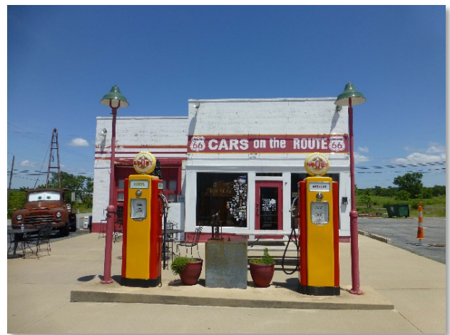
Figure 15. Cars on the Route gift shop and café in Galena.