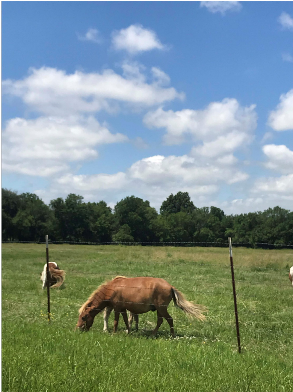
Figure 19. Thousands of acres of land have been cleaned up and restored to agricultural use at the site. In this photo, horses graze in the Treece, Kansas, area.

For more information about EPA's Superfund Redevelopment Initiative, visit: https://www.epa.gov/superfund-redevelopment-initiative .