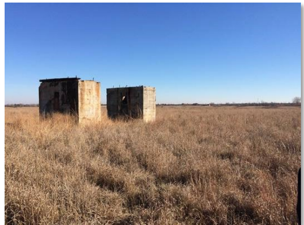
Figure 3. Abandoned mine workings.