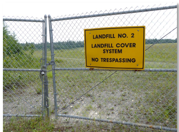
Figure 3. Landfill Cover No. 2, part of the site's final remedy.