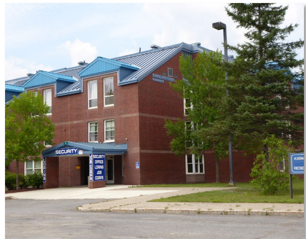
Figure 8. The entrance to the Loring Job Corps Center on site. The national Job Corps Center program was founded in 1964.