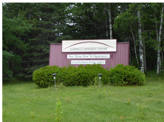
Figure 5. The entrance to Loring Commerce Centre.