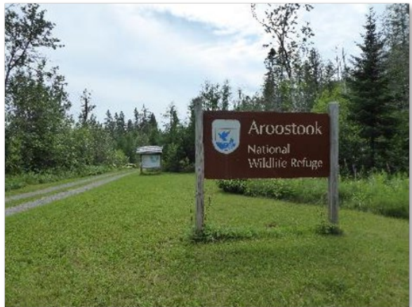
Figure 11. Entrance to Aroostook National Wildlife Refuge.