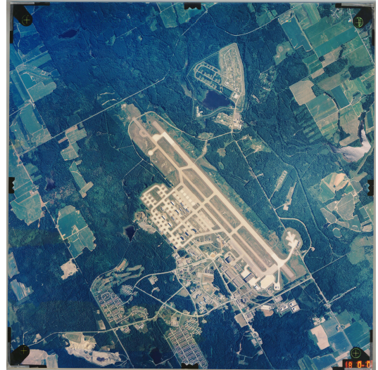
Figure 16. Aerial view of the site.

According to Carl Flora, the LDA's president and CEO, a new round of development is needed and the LDA is actively seeking out further site redevelopment opportunities. A newly formed company, Loring Industries, recently moved on site and is looking to expand its light vehicle manufacturing capabilities. Mr. Flora continues to seek additional redevelopment opportunities. The LDA is currently marketing site areas as opportunities for aircraft repair and maintenance facilities, aviation and logistics operations, and manufacturing facilities.