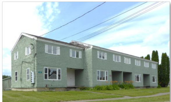
Figure 14. Housing at the Inland Winds Housing development.