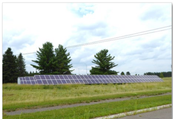
Figure 15. Loring Energy Projects runs a solar panel pilot project onsite.