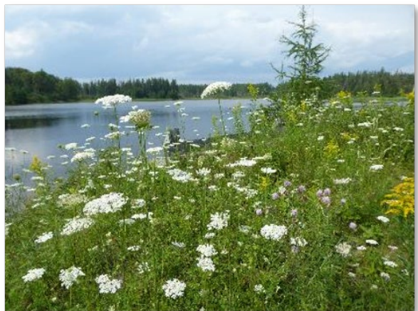
Figure 12. Wildflowers at Aroostook National Wildlife Refuge.