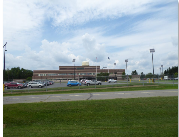
Figure 7. The Defense Finance and Accounting Services Office operates out of a 142,000-square-foot facility on site.

Founded in 1989, this business manufactures inkjet inks for industrial, specialty and desktop business segments. Its mission is to develop innovative, high-quality inks using thermal inkjet technology. In 2017, the company had sales of $2.5 million and provided over $400,000 in estimated employee income.