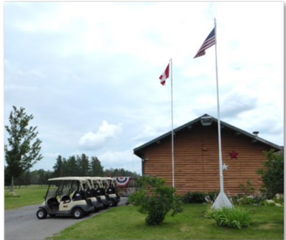
Figure 13. The clubhouse at Limestone Country Club.

A solar farm is located at the intersection of Georgia Road and Taft Road. The installation is part of a pilot project by Loring Energy Projects, which is exploring three renewable energy project opportunities at the site. First, the company is developing plans for a 100-megawatt solar project at the Loring Commerce Centre. In 2016, the LDA reached a lease agreement with Ranger Solar for the potential installation of the solar facility. Second, the Maine Power Express project plans to build a transmission line from Haynesville in Southern Aroostook County to Boston to bring wind power from northern Maine to southern New England. Finally, the LDA acquired a 185-mile pipeline corridor with a jet fuel pipeline leased to Bangor Natural Gas, which has