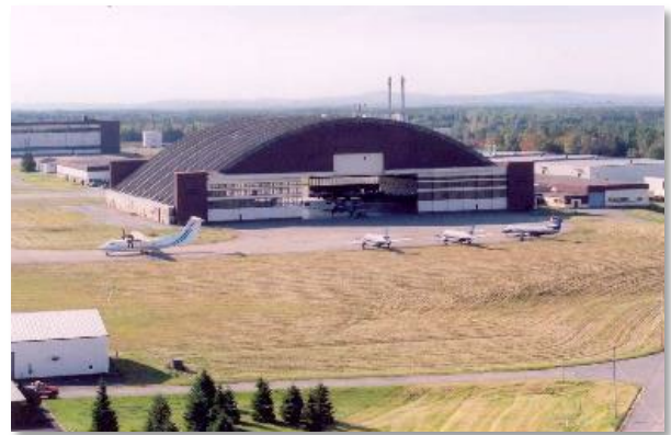
Figure 4. This aircraft hangar on site was once one of the largest in the United States.

In 1997, the LDA received a 55-year lease for the former Loring Air Force Base property, pending U.S. Air Force environmental investigations and cleanup. In 2001, the U.S. Air Force transferred to the LDA a majority of the former base area – clean areas as well as areas where environmental issues had been resolved. In 2004, the LDA received the remaining property from the U.S. Air Force. In total, the LDA received ownership of over 9,000 acres of land. The LDA now had the task of turning the Loring Air Force Base Reuse Plan into reality. To make it possible,