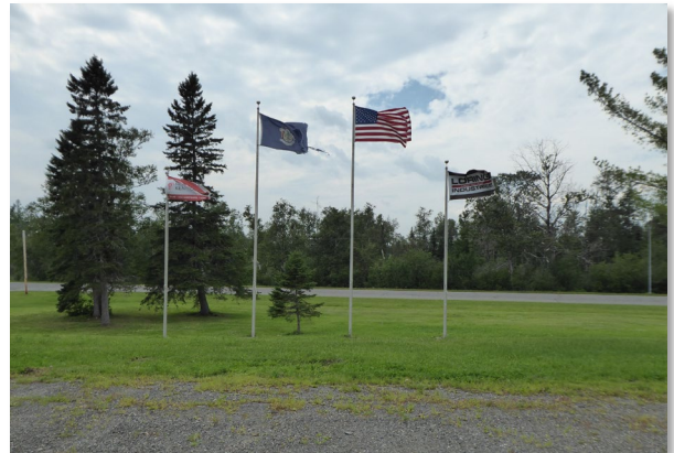
Figure 17. United States, Maine and Loring Commerce Centre flags flying on site.

Today, site uses include commercial, industrial, recreational, ecological and residential areas as well as renewable energy projects. The U.S. Department of Defense also headquarters its Defense Finance and Accounting Services Office on site. On-site businesses support local economic growth, providing over 800 jobs and over $29 million in estimated annual employee income. In 2017, on-site businesses generated over $11 million in sales revenues. Closure of the Loring Air Force Base was a major blow to the local economy through the loss of the community's largest regional employer. However, the consideration of future uses throughout the cleanup of the Loring Air Force Base Superfund site has helped prime the property for continued redevelopment and revitalization of the local economy.