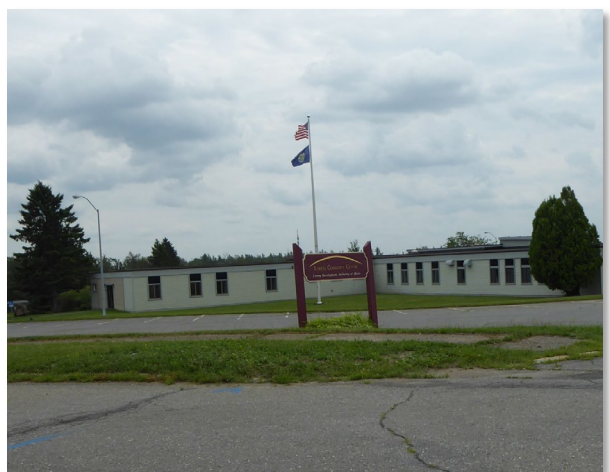
Figure 9. The LDA operates out of this building.