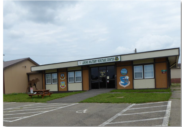
Figure 10. The Loring Military Heritage Center operates out of this building.

In 1998, thousands of acres of the former base property were transferred from the U.S. Air Force to the U.S. Fish & Wildlife Service for use as a wildlife refuge. This refuge, Aroostook National Wildlife Refuge, covers 7,750 acres in northern Maine; the refuge also manages more than 2,500 acres of conservation easements in areas not located on the former base. Immediately after the establishment of the refuge, extensive restoration work followed. Today, the refuge conserves and protects a diverse array of native wildlife habitats and species, educates visitors about the refuge and native wildlife and highlights the benefits of land conservation. It is the northernmost national wildlife refuge in the northeast United States. 3