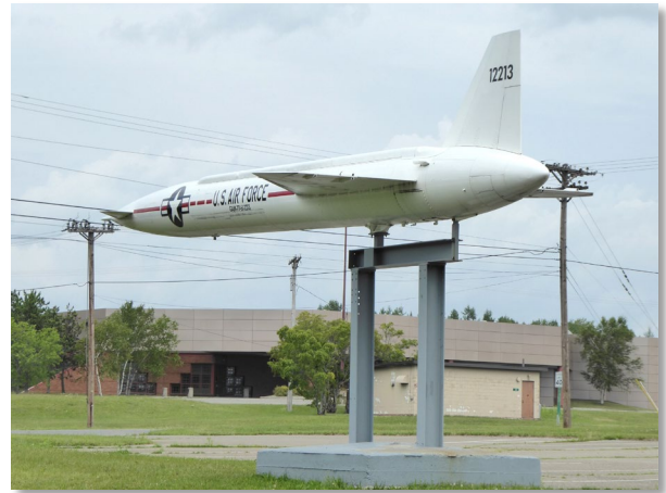
Figure 2. A missile on display at the former Air Force base.

The U.S. Air Force, EPA and the Maine Department of Environmental Protection entered into a Superfund Federal Facility Agreement (FFA) in January 1991 and updated it in 1993 and 1995. The agreement provides a framework and timetable for site investigations and cleanup. In 1994, a program review was conducted as part of a fast-track federal cleanup initiative for closing military bases. Recommendations included performing early actions at sites where human health and environmental risks were well-defined, which helped to set the stage for expediting cleanup actions. The site's FFA established 15 operable units to address contamination in site soils, groundwater, surface