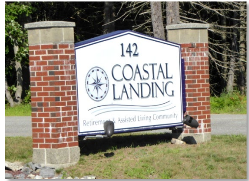
Figure 8. Coastal Landing provides independent senior living onsite.

There are currently 38 businesses and organizations operating at TechPlace. They include an amphibious aircraft manufacturer, a bio-derived fuel-based rocket startup, an oceanographic laboratory, a maritime surveillance instruments startup and an aquatic drone startup, among others. Together, these businesses employ 120 people and provide over $8 million in estimated annual employee income.