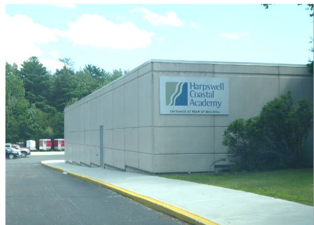
Figures 21-22. A community college and other educational opportunities are available at Brunswick Landing.