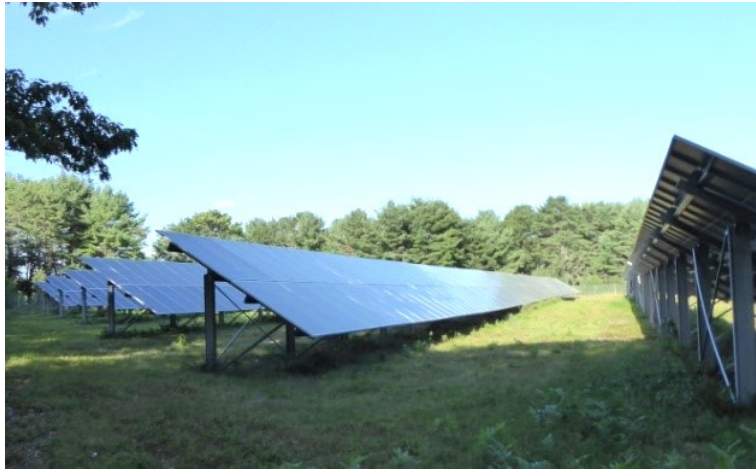
Figure 23. Bowdoin College operates this solar installation on site.

The Brunswick Renewable Energy Center enables companies and organizations to develop power generation facilities and microgrid technologies on site. The Center currently consists of two renewable energy sources – a solar farm installation and an anaerobic digester – that generate about 75 percent of the energy needed at the site. The anaerobic digester can generate 1 megawatt of electricity and the solar farm can generate 1.5 megawatts of electricity. The MRRRA fulfills remaining power needs from off-site wind power sources, making Brunswick Landing 100 percent green energy-sourced. Future plans include doubling the size of the anaerobic digester, which will make it possible to meet all of Brunswick Landing’s energy needs on site.