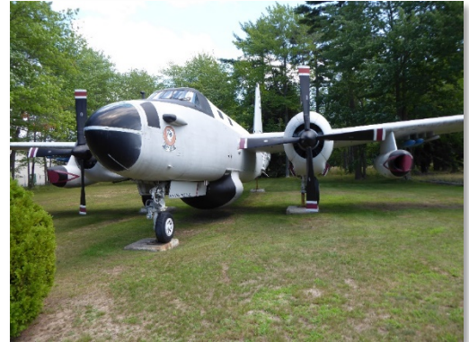
Figure 2. Aircraft, like the one pictured above were kept at the former air station.

Constructed in 1935 by the Maine Emergency Relief Administration, Brunswick airport was originally part of a chain of civilian airports in the region. During World War II, the U.S. Navy commissioned the Brunswick Naval Air Station (Brunswick) to support anti-submarine warfare operations in the Atlantic Ocean. Following World War II, Brunswick was deactivated and slated for commercial development when the U.S. Navy decided to develop the station as a Master Jet Base. Beginning in 1951, Brunswick was expanded into a full-scale naval air station, providing support during the Cold War, Korean War and both Iraq wars. During naval station operations, hazardous materials, including solvents, acids, paints and oils were disposed of in site landfills and unlined pits. Additional handling and storage of hazardous materials resulted in isolated spills and leaks. These actions contaminated site soil and groundwater across portions of the site. Initial investigations in 1983 and 1984 documented historical hazardous material usage and waste disposal practices. EPA placed the Brunswick Naval Air Station on the Superfund program's National Priorities List in 1987.