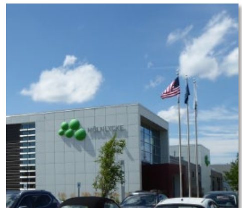
Figure 7. Molnlycke Health Care operates out of this building.