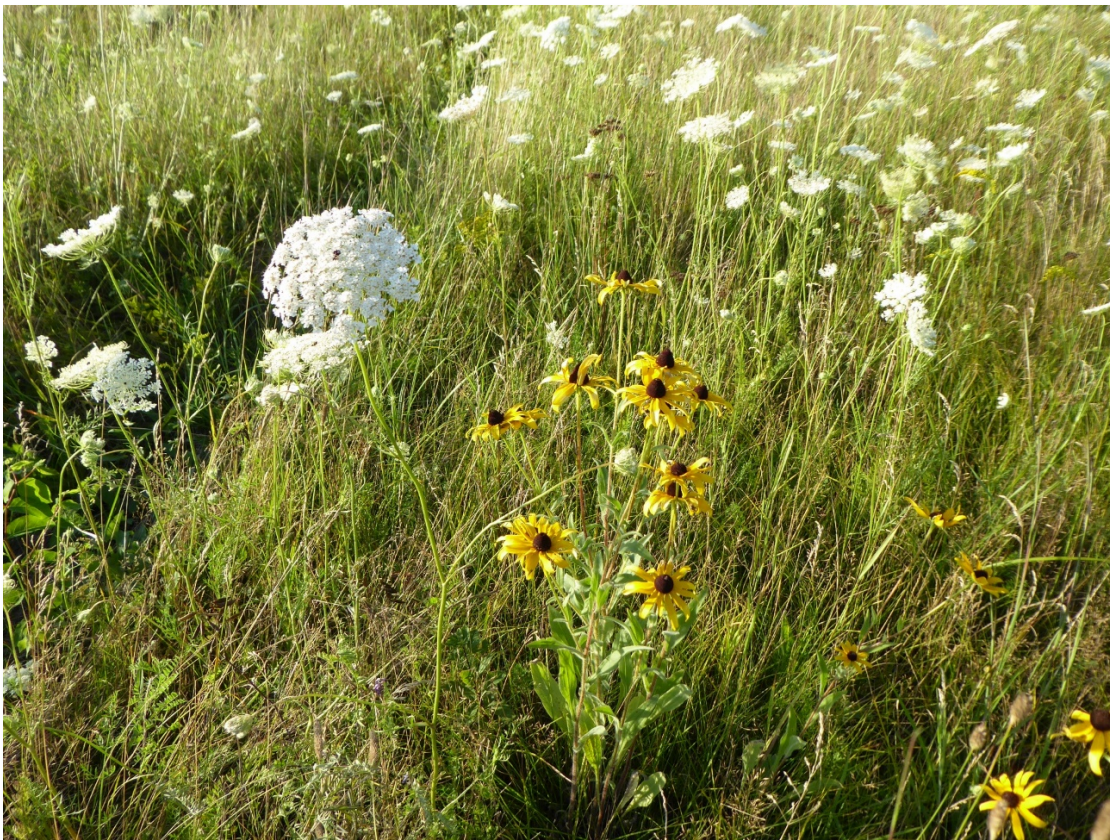
Figure 17. Natural areas on site are home to native grasses, flowers and insects.

The 2007 Reuse Master Plan included active recreation areas and open space and natural areas. Today, these uses include the Kate Furbish Nature Preserve and the Mere Creek Golf Club.