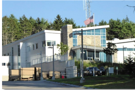
Figures 15-16. The Maine National Guard and Marine Corps Reserve Center operate out of this building.