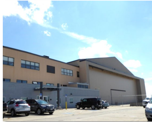
Figures 11-12. TechPlace currently houses 38 businesses and organizations.