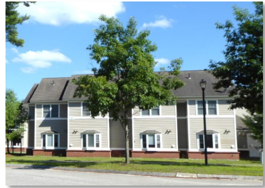
Figure 20. Former military housing converted for civilian use.

In 2004, the Navy had privatized family housing units on the base with a fifty year land lease with GMH Housing, which constructed over 220 new family housing units and managed the existing stock of over 482 units in three places on and near the station property (on the base, McKean Street and the Topsham Annex). The U.S. Navy transferred the land lease to the MRRRA in 2011. In turn, the MRRRA sold the land to a developer, who rented out most of the units and sold about 230 units to homeowners. Several years later, the developer sold the remaining rental units to another company. The company also plans to build new apartments and condos on other land acquired from the MRRRA. Another housing developer recently bought land from the MRRRA and plans to build about 150 apartments on site.