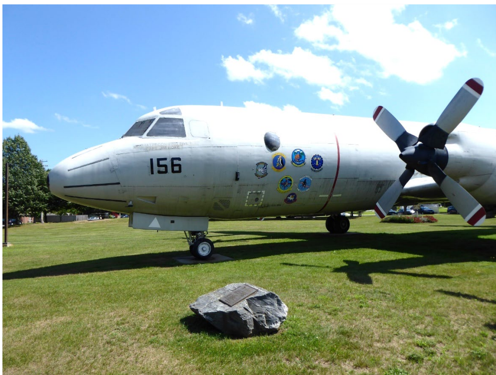
Figure 24. A once-active P-3 Orion on display near the Brunswick Naval Museum & Memorial Gardens.

Today, the former naval air station is home to commercial, industrial, recreational, educational, ecological, residential and renewable energy projects. Additionally, the Maine National Guard and Marine Corps operate facilities on site. On-site businesses support local economic growth, providing almost 1,800 jobs and nearly $80 million in estimated annual employee income. In 2018, on-site businesses generated over $345 million in combined sales revenue. Moving forward, the MRRRA will continue to implement the 2007 Reuse Master Plan. With many of the former military buildings occupied, the MRRRA is now focused on opportunities for new commercial office, retail and industrial growth at the site.