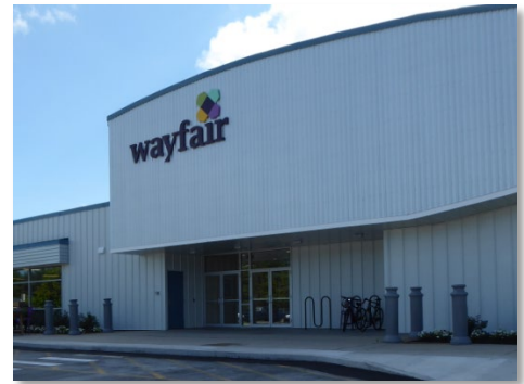
Figure 5. Wayfair operates its customer contact center out of this building.

This manufacturer was one of the first companies to locate at Brunswick Landing, in 2011. It operates out of an 80,000-square-foot facility and specializes in surgical and wound care medical equipment. The company operates globally and is headquartered in Sweden. The Brunswick business location provides over $4 million in estimated annual employee income and generated $19 million in sales revenue in 2018.