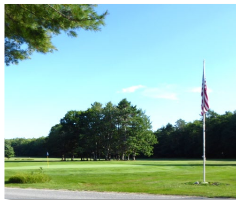
Figures 18-19. The Mere Creek Golf Club.