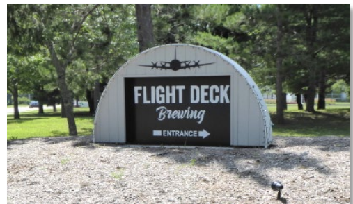
Figure 10. Flight Deck Brewing provides a tasting room and restaurant on site.