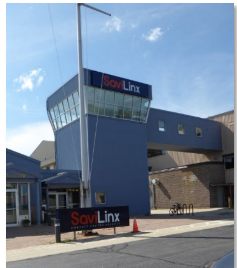
Figure 6. SaviLinx opened onsite in 2013.