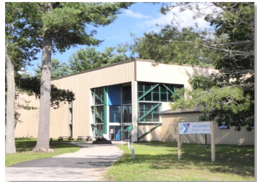
Figure 9. The Landing YMCA operates out of this facility.