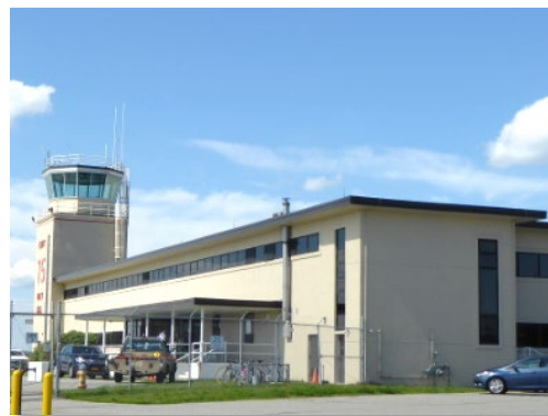
Figures 13-14. The Brunswick Executive Airport.