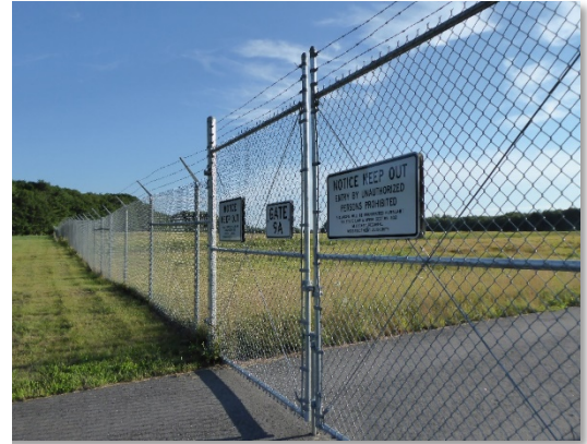
Figure 3. One of the capped landfills on site.

The U.S. Navy began significant environmental restoration actions in August 1994; U.S. Navy cleanup is ongoing today. To date, cleanup has included excavation and on-site disposal of contaminated soil and materials in site landfills, landfill capping, excavation and off-site disposal of contaminated ash, removal of underground storage tanks, construction of subsurface groundwater diversion barrier walls, groundwater extraction and treatment, land use controls, and long-term groundwater monitoring. Recent U.S. Navy investigations have confirmed the presence of poly- & perfluoroalkyl substances (PFAS) in groundwater on the former base. Nearby public and private drinking water supplies have not been impacted by PFAS-impacted water identified on the former base. The U.S. Navy continues to evaluate areas where these substances have been identified at the site.