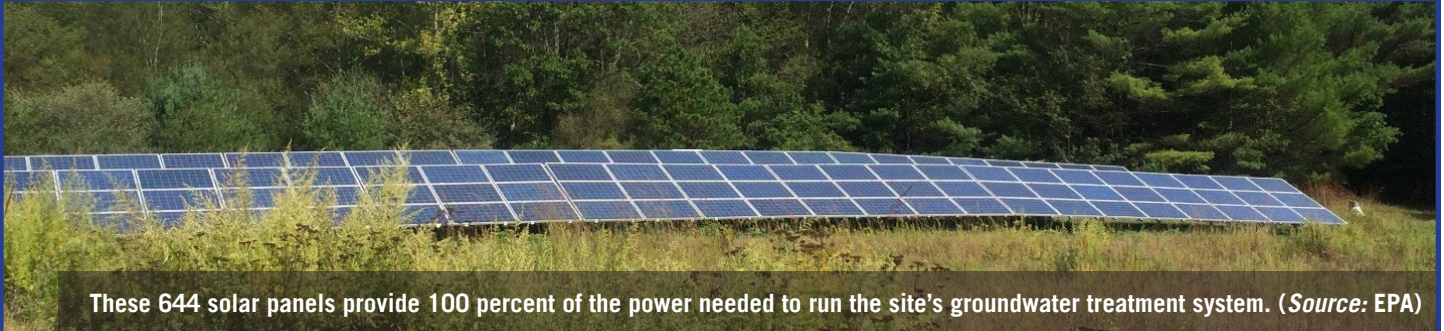
These 644 solar panels provide 100 percent of the power needed to run the site's groundwater treatment system.

Site Location: North Hixville Road, Dartmouth, Massachusetts 02747