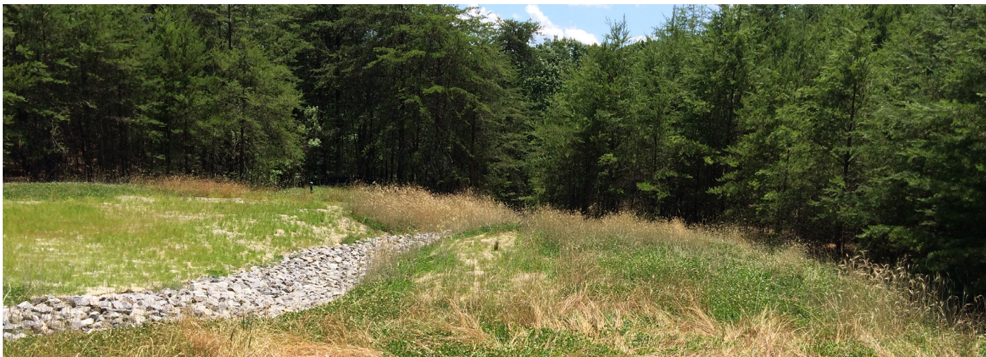
Native plant revegetation at the Excellence in Site Reuse Award-winning Henry’s Knob Superfund Alternative Approach site.