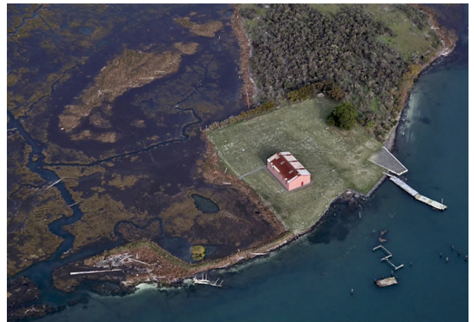
Region 9 recognized the Tuluwat Village site with an Excellence in Site Reuse Award.