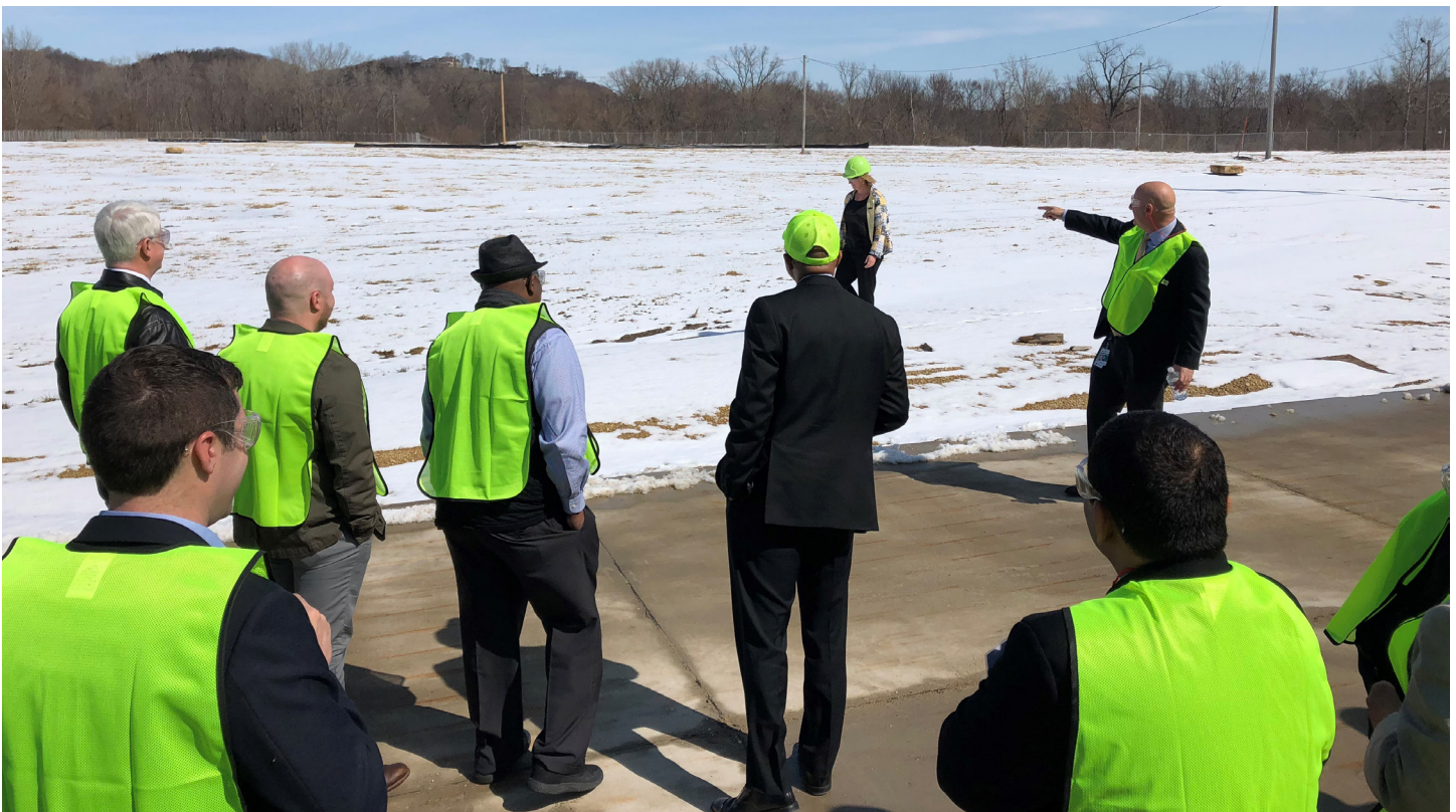
Touring part of the John Deere (Dubuque Works) Superfund site where native plantings and walking trails are supporting local ecology and providing recreation amenities for company employees.