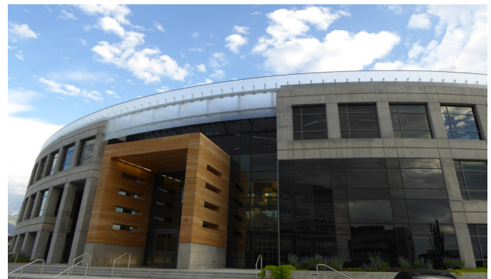
Overstock.com facilities at the former Midvale Slag Superfund site.