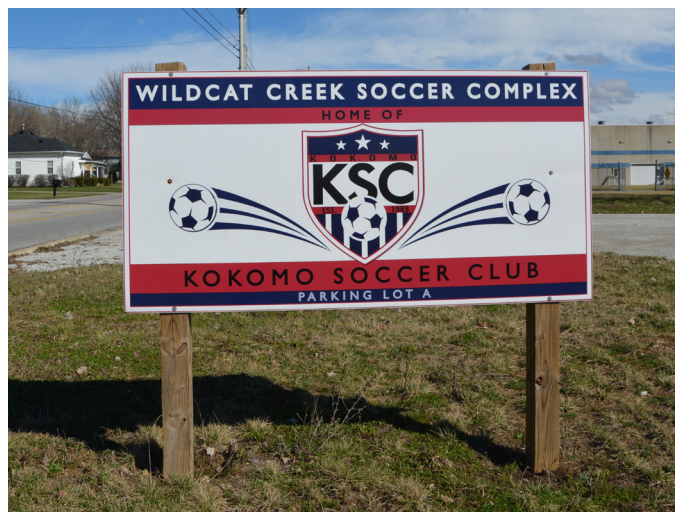
The Wildcat Creek Soccer Complex, located on part of the Continental Steel Superfund site, offers recreational amenities to the community.