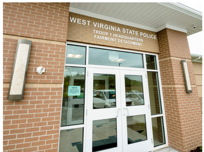
Entrance to West Virginia State Police facilities at the Sharon Steel Corp. (Fairmont Coke Works) Superfund site.