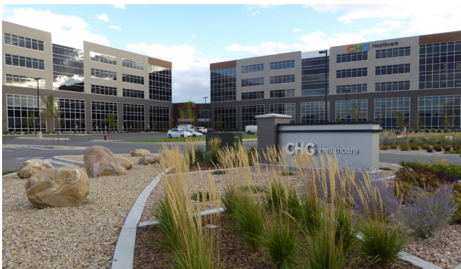
The former Midvale Slag Superfund site is now home to dynamic mixed-use areas that include stores, homes, parks and offices.