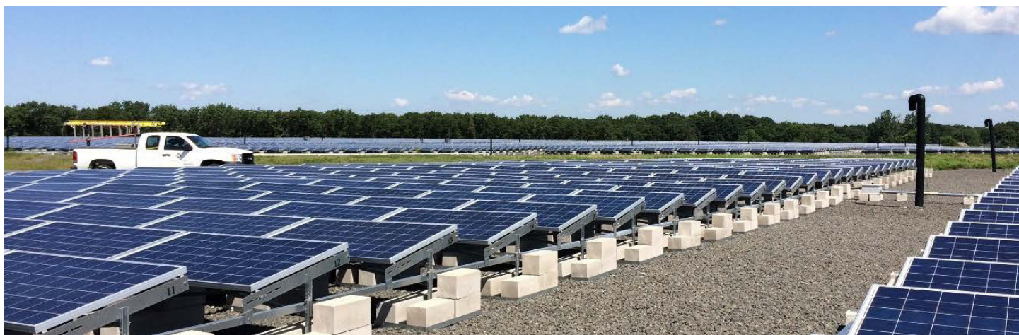
Solar panels on the Brick Township Landfill Superfund site.