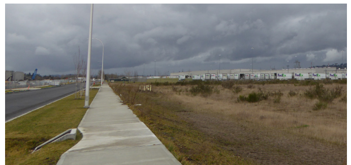
Troutdale Reynolds Industrial Park also includes a lake and walking paths for employees working on site.