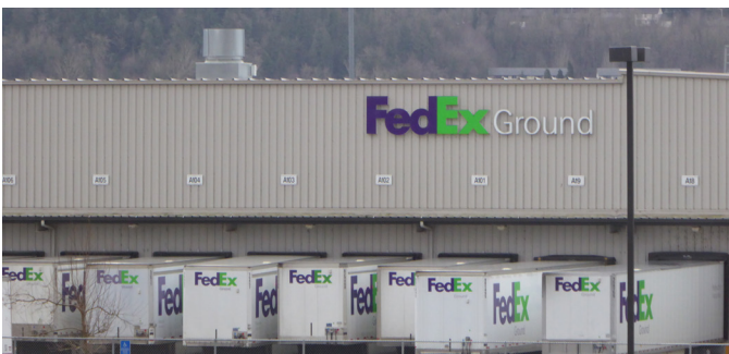
This FedEx Ground distribution facility anchors the Troutdale Reynolds Industrial Park at the Reynolds Metals Company Superfund site.

In January 2018, EPA Region 10 celebrated the redevelopment of the Reynolds Metals Company Superfund site in Troutdale, Oregon, with the Howard Orlean Excellence in Site Reuse Award. Collaborative partnerships and cleanup design with an eye on future use enabled the development of Troutdale Reynolds Industrial Park. Anchored by a FedEx Ground facility and with an Amazon fulfillment center under construction, the facility is bringing jobs, employment income and tax revenues to the community.