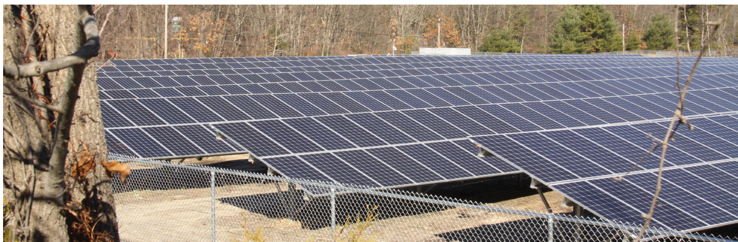
Solar panels on the Shaffer Landfill at the Iron Horse Park Superfund site.