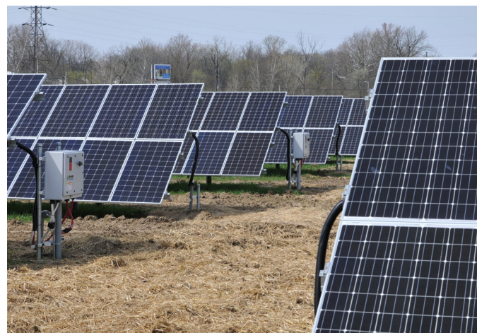
Other reuses at the Continental Steel Superfund site include solar facilities and stormwater retention areas.