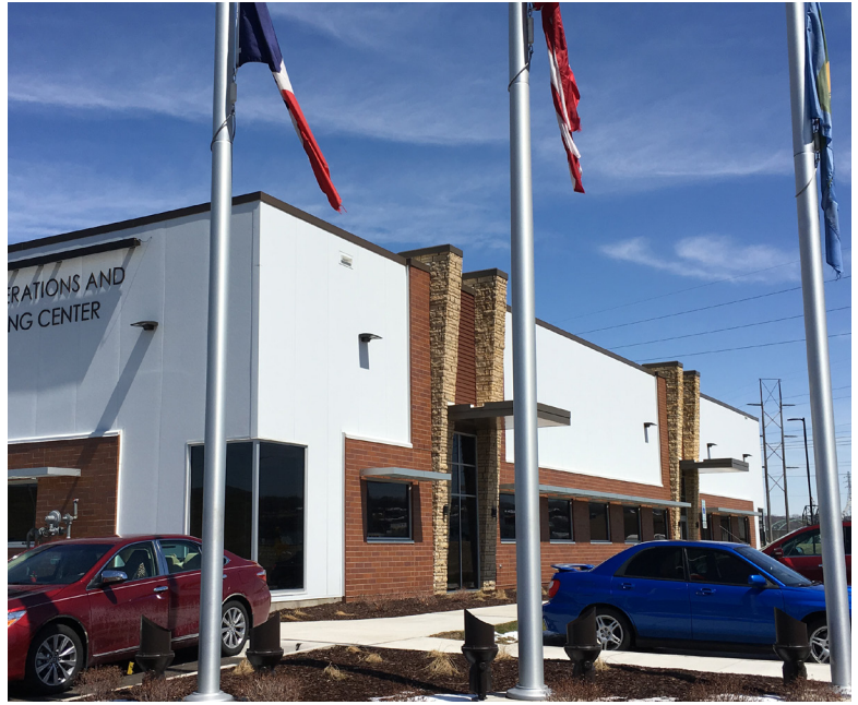
Region 7 recognized the new Jule Public Transit Operations and Training Center at the Peoples Natural Gas Co. Superfund site with a L.E.A.F.S. award.

At the John Deere (Dubuque Works) Superfund site, the company installed 6 inches of soil across the northern part of the landfill surface, seeded native grasses and wildflowers to stabilize soil, installed a walking trail to promote employees' wellbeing, and installed pollinator habitats that will increase species diversity.