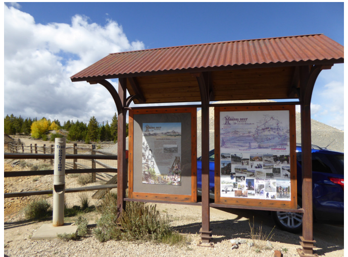
The Mineral Belt Trail, an award-winning, multi-use recreation trail at the California Gulch Superfund site in Leadville, Colorado, is one of several uses that earned an Excellence in Site Reuse Award.