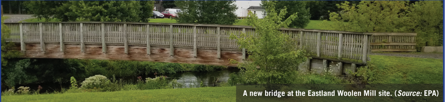
A new bridge at the Eastland Woolen Mill site.

Site Location: Main Street, Corinna, Maine 04928