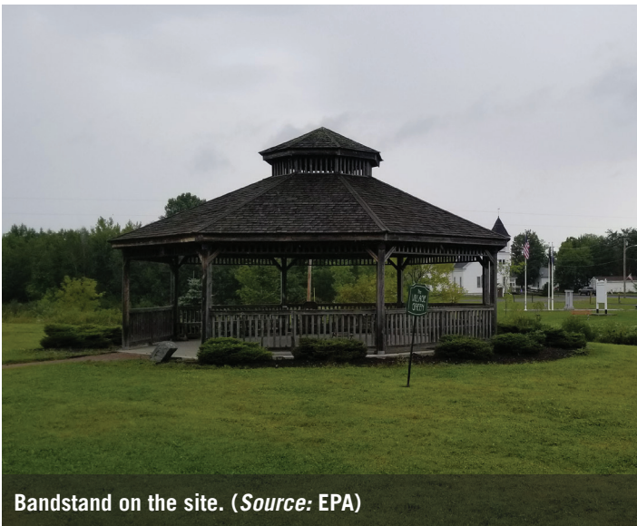
Bandstand on the site.

Today, a 20-unit senior housing facility is located on part of the site. EPA, the Corinna town government and state agencies worked to relocate the historic Odd Fellows Building off the site; a country store and restaurant are now located in it. A plan for a village-style subdivision and greenspace along the river was approved in 2006. In 2008, a bandstand and boardwalk were built on site. In 2012, EPA took 80 percent of the site's land area off the NPL. The site's transformation is a testament to the power of collaboration and the vital role of reuse planning in supporting long-term community revitalization efforts.