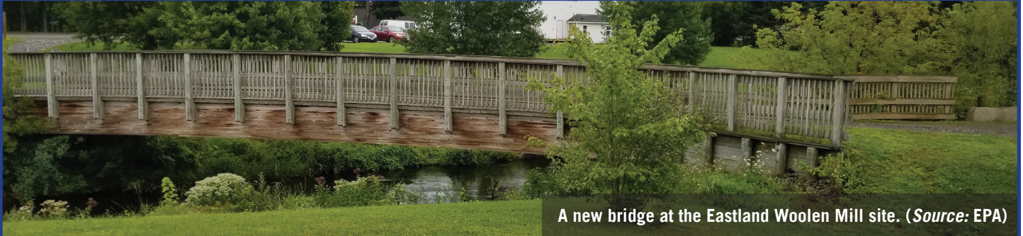
A new bridge at the Eastland Woolen Mill site.

Site Location: Main Street, Corinna, Maine 04928