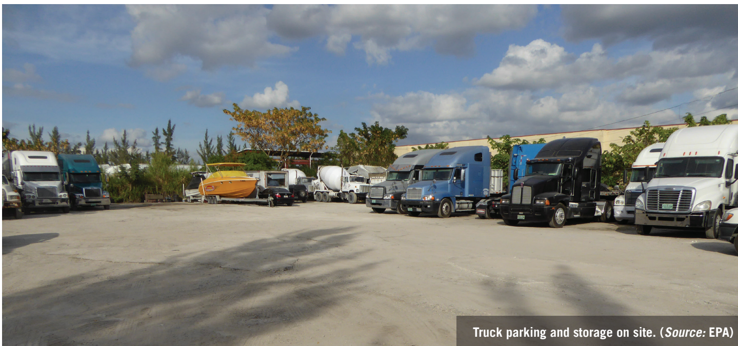
Truck parking and storage on site.

The cleanup and stakeholder coordination has paid off. In 2005, a trucking company purchased Parcel D at the site for use as a commercial truck storage area. A heavy machinery parts company uses the eastern part of Parcel C for operations. The company also leases the western part of Parcel B for commercial truck parking and storage. These businesses bring jobs, incomes and tax revenues to the area. In 2016, a small business owner purchased 10-acre Parcel A for development of a custom boat manufacturing and sales location. Construction on the property is underway.