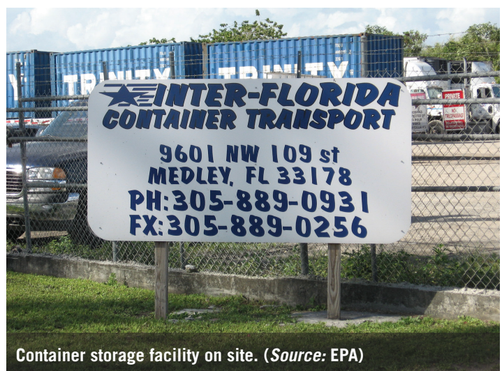
Container storage facility on site.

Throughout the cleanup process, site stakeholders had future use in mind. EPA supported the process, developing language for protective institutional controls that would be compatible with the reasonably anticipated reuse of the site. These efforts provide transparency and clarity about which land uses are compatible with the site's remedy.