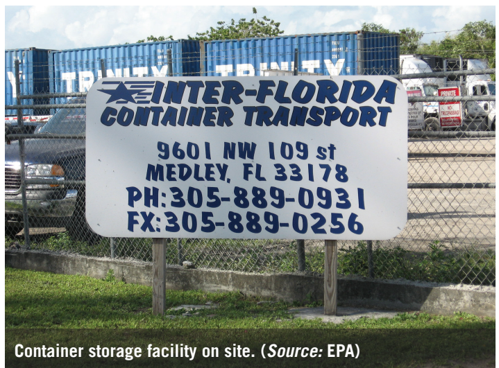
Container storage facility on site.

Throughout the cleanup process, site stakeholders had future use in mind. EPA supported the process, developing language for protective institutional controls that would be compatible with the reasonably anticipated reuse of the site. These efforts provide transparency and clarity about which land uses are compatible with the site's remedy.