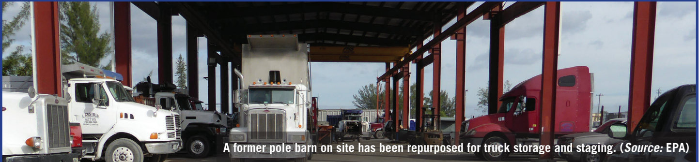
A former pole barn on site has been repurposed for truck storage and staging.

Site Location: 11100 NW South River Drive, Medley, Florida 33178