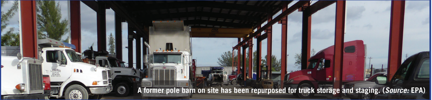
A former pole barn on site has been repurposed for truck storage and staging.

Site Location: 11100 NW South River Drive, Medley, Florida 33178