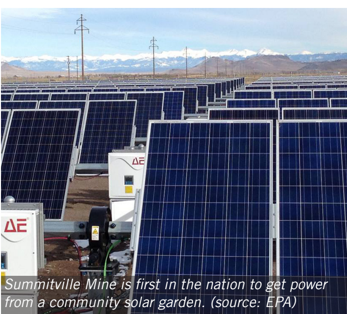
Summitville Mine is first in the nation to get power from a community solar garden.