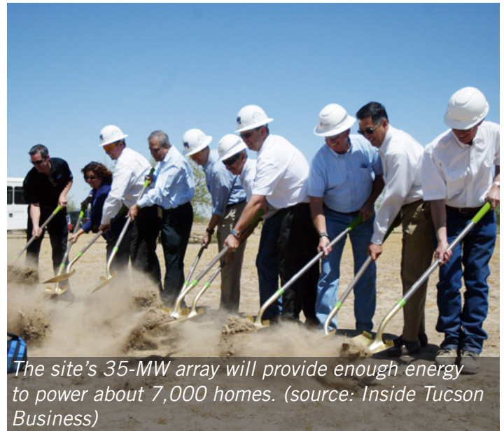
The site's 35-MW array will provide enough energy to power about 7,000 homes.

Building on the 2011 assessment, ASARCO, Tucson Electric Power and Clenera, LLC moved forward with plans to redevelop a nearby area of the ASARCO mine property for a utility-scale solar array. The project, called the Avalon Solar Facility, broke ground in May 2014. The facility will deliver 35 MW of clean energy for the local utility provider. Tucson Electric Power will buy generated power under a 20-year power purchase agreement.