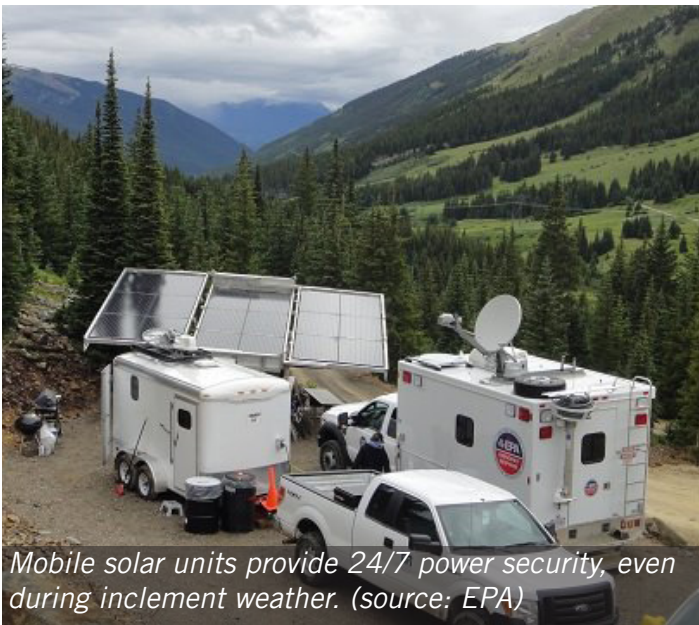
Mobile solar units provide 24/7 power security, even during inclement weather.

Gold mining at this 1,400-acre site released metals-laden mine water into the Alamosa River. In 1994, EPA began cleaning up the area, which included capturing and treating contaminated water. Water treatment requires consistent, year-round power sources, while