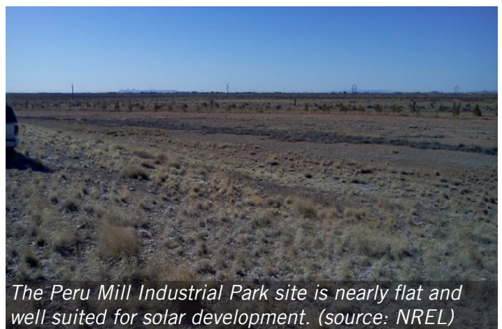
The Peru Mill Industrial Park site is nearly flat and well suited for solar development.

This 1,500-acre asbestos mine operated from the late 1800s until 1993. After mining operations ended, EPA conducted removal actions to assist in preventing off-site asbestos contamination and protect human health. Seeking opportunities to reuse idle land, EPA and NREL selected the site for a renewable energy assessment. The assessment evaluated potential solar power opportunities and identified 11 acres of the site suitable for large solar arrays that could generate up to 2.2 MW. Incentives from the Vermont Sustainably Priced Energy Enterprise Development (SPEED) program could help enable the site's reuse for solar power generation in the future.