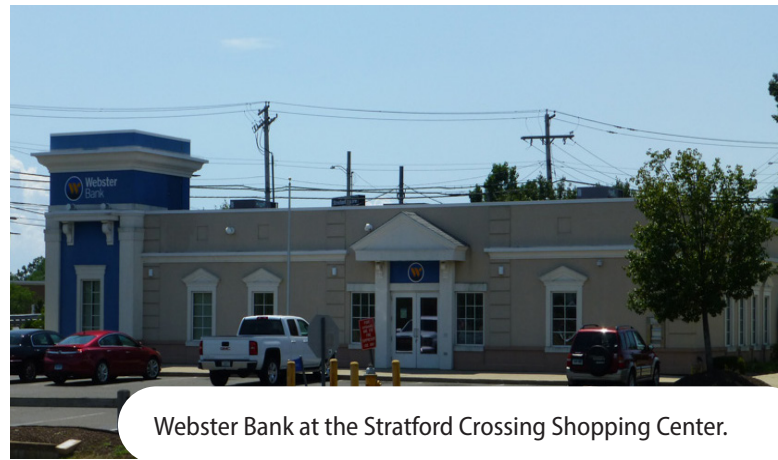
Webster Bank at the Stratford Crossing Shopping Center.