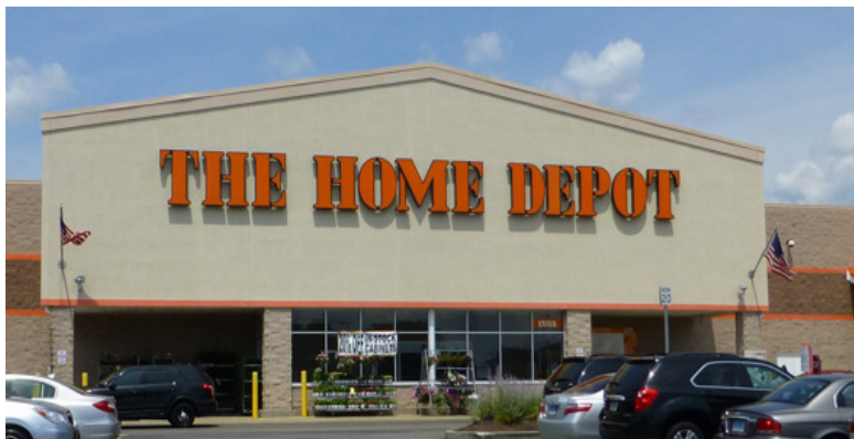
Home Depot at Stratford Crossing Shopping Center.

As investigations and cleanup planning moved forward, future use considerations were taken into account. The site's central location in Stratford and its proximity to Interstate 95 attracted developers interested in commercial redevelopment. Close coordination between a developer, EPA and the U.S. Army Corps of Engineers (USACE) resulted in cleanup plans that made large-scale commercial use of the site possible.