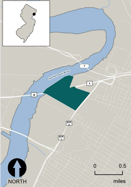
A map of the site in New Jersey.