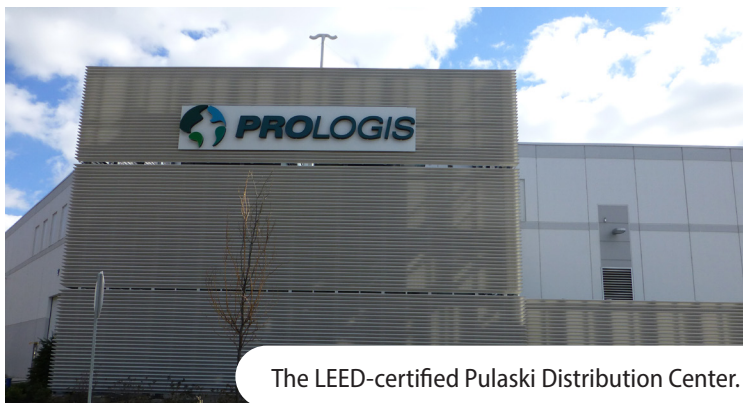
The LEED-certified Pulaski Distribution Center.

Between 1985 and 1986, the New Jersey Department of Environmental Protection (NJDEP) put out subsurface fires and capped a 45-acre area of the site to address immediate concerns. NJDEP excavated and re-compacted over one million cubic yards of contaminated materials. Cleanup also included off-site disposal of contaminated soil, cylinders and drums, and installation of a gas venting system, drainage ditches, and a firebreak trench for the capped area. In 1995, EPA and NJDEP selected a remedy for the site which included removal of remaining buried drums and contaminated soil, capping of the landfill area, installation of a gas venting system, replacement of the Sip Avenue Ditch, quarterly sampling of groundwater, the installation of fencing, and implementation of a wetlands assessment and restoration plan. When outside parties expressed interest in buying the site property and redeveloping the area, NJDEP and EPA worked with them to redesign the cap to allow for development.