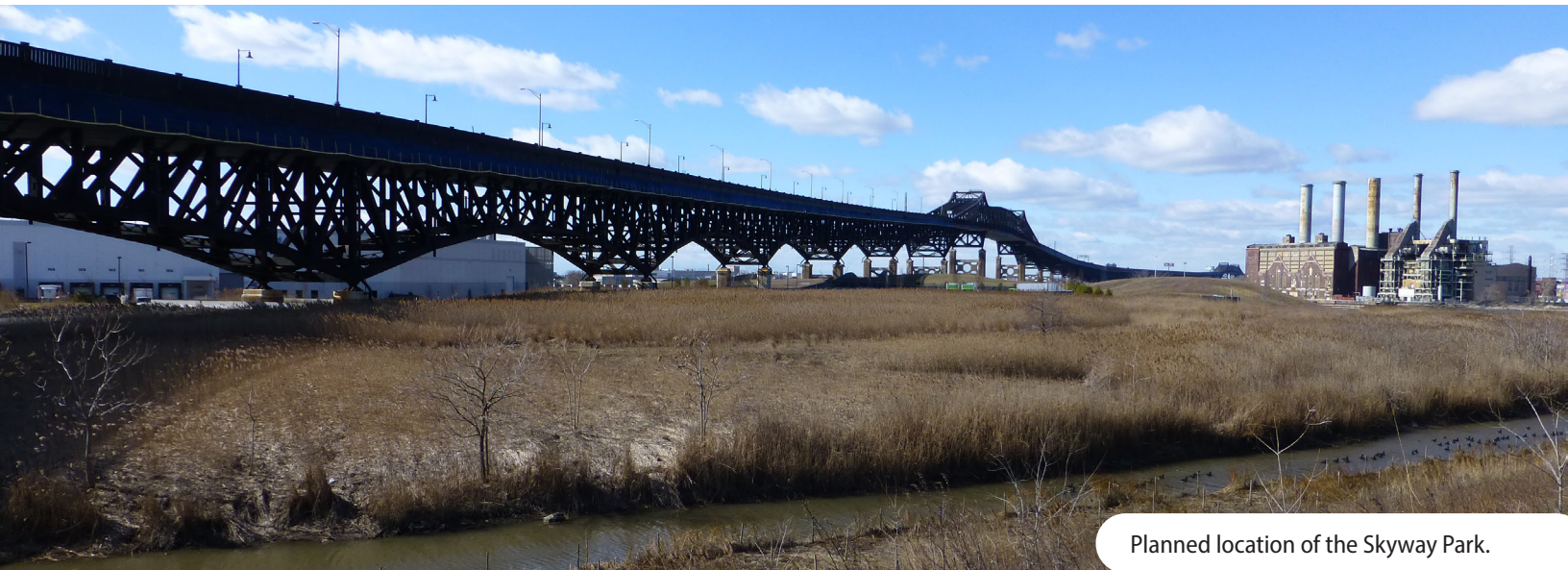
Planned location of the Skyway Park.