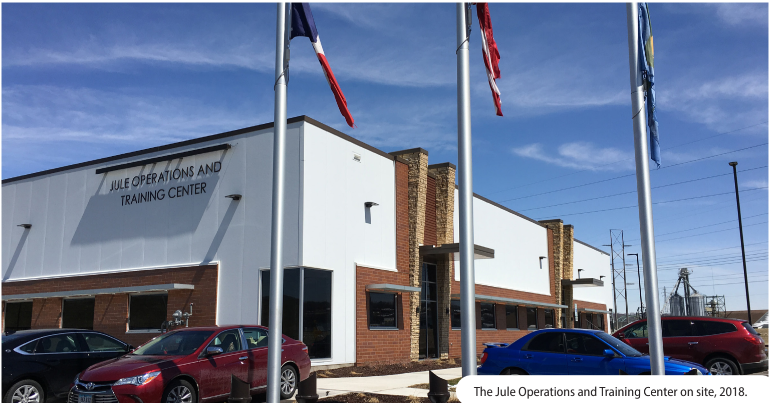
The Jule Operations and Training Center on site, 2018.

Conversion of the property required that the City demolish the former facility, place fill material on top of the old foundation, and construct the new facility on the existing foundation. The City worked with EPA to address vapor intrusion issues at the site that would have impeded the new use. Work on the facility began in 2016 and finished in 2017. Today, The Jule Operations