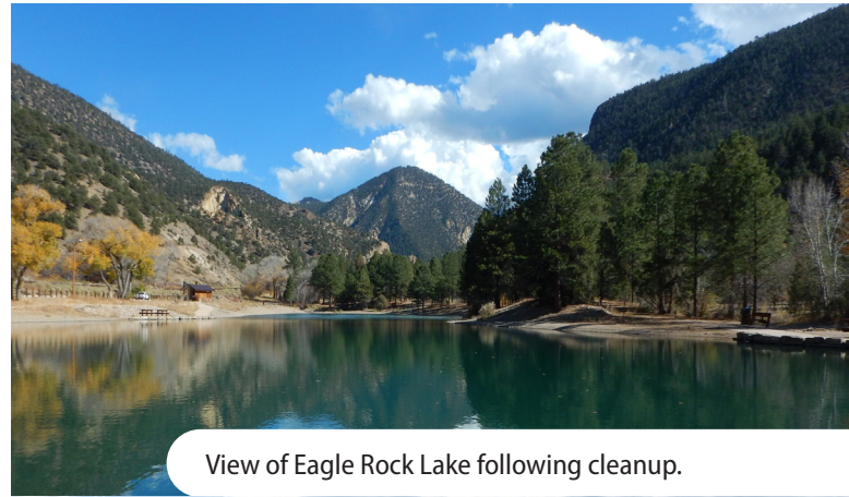
View of Eagle Rock Lake following cleanup.

The cleanup and restoration of Eagle Rock Lake illustrates how effective partnerships and collaboration among diverse site stakeholders can provide significant economic, public health and environmental benefits. In 2017, EPA Region 6 presented the project team with its Greenovations Award. It recognizes the community's leadership in pursuing recreation and public health priorities as well as Chevron Mining's commitment to supporting safe, responsible, innovative and sustainable redevelopment.