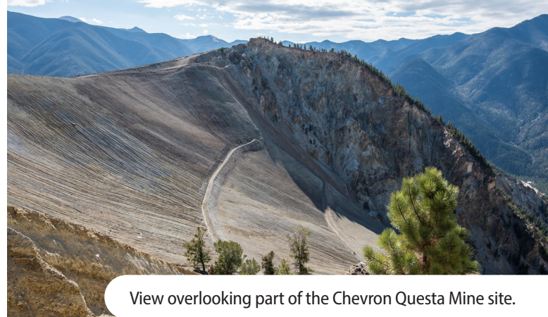
View overlooking part of the Chevron Questa Mine site.