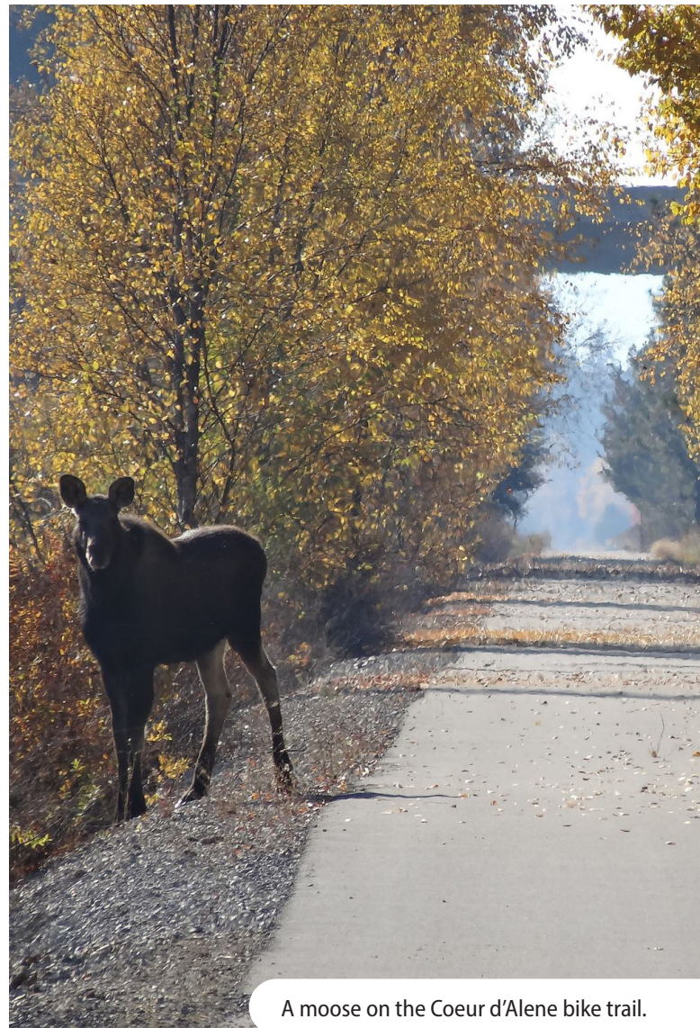
A moose on the Coeur d'Alene bike trail.