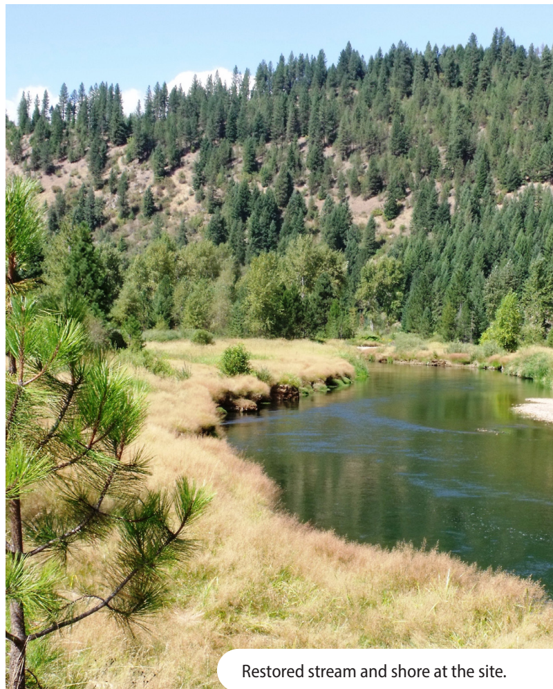
Restored stream and shore at the site.

Local government officials and residents continue to work together to support site development efforts and attract new investment to the area. Shoshone County Commissioners have developed a multi-pronged approach to meet infrastructure improvement goals, including the installation of broadband Internet service in the area, expansion of Shoshone County Airport and improvement of labor force training opportunities. The successes at the Bunker Hill Mining & Metallurgical Complex Superfund site are an example of what can happen when future site use is considered early in the cleanup process and when stakeholders commit to developing a shared vision for a safe and economically sustainable future.