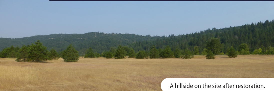
A hillside on the site after restoration.

For more information see: www.epa.gov/superfund-redevelopment