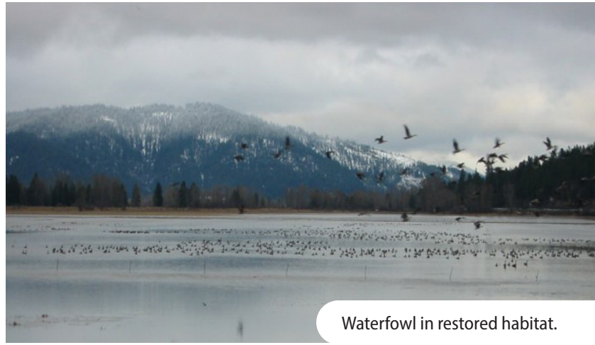
Waterfowl in restored habitat.

Today, the site supports a wide range of commercial and industrial businesses, public services, and housing. For example, Silver Mountain Resort – a year-round destination offering a wide range of recreation opportunities to locals and visitors of all ages – is located on site. In addition to skiing, snowboarding and snow tubing, the resort includes