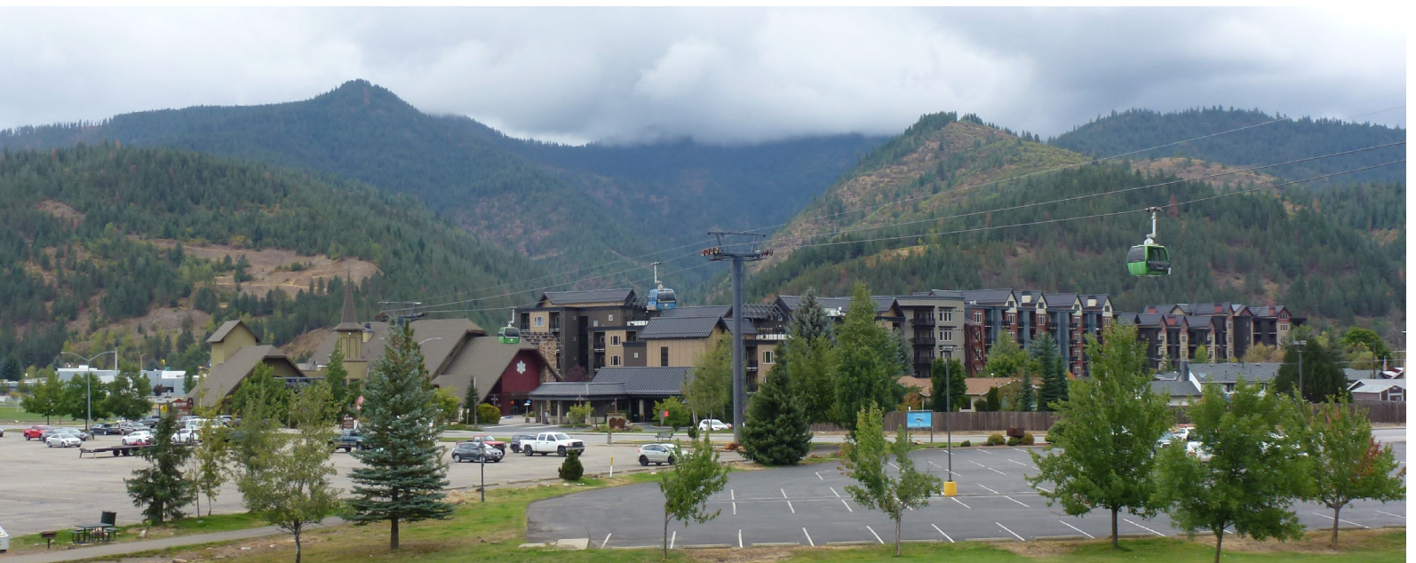
The Silver Mountain Resort and the Kellogg skyline.

Cleanup has also resulted in significant ecological benefits. For example, in 2011, EPA and other project stakeholders completed the conversion of nearly 400 acres of once-contaminated agricultural land in the lower Coeur d'Alene River Basin into thriving wetland habitat. The area's cleanup and restoration