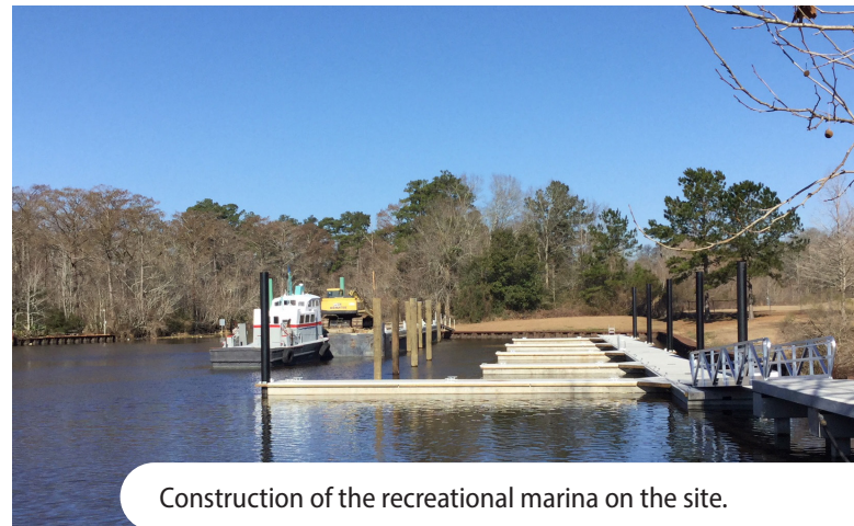
Construction of the recreational marina on the site.

In May 2018, EPA Region 6 recognized the city's efforts with its Excellence in Site Reuse Award. Region 6 established the award