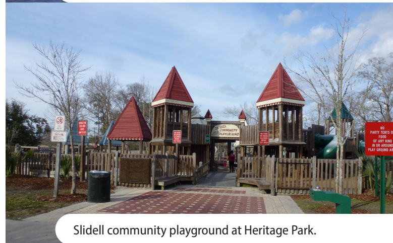
Slidell community playground at Heritage Park.