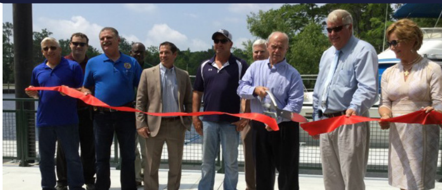
Mayor Drennan and Slidell elected officials cut the ribbon to officially open the marina.

For more information see: www.epa.gov/superfund-redevelopment