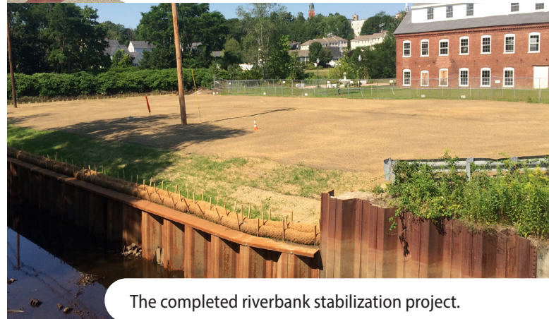
The completed riverbank stabilization project.