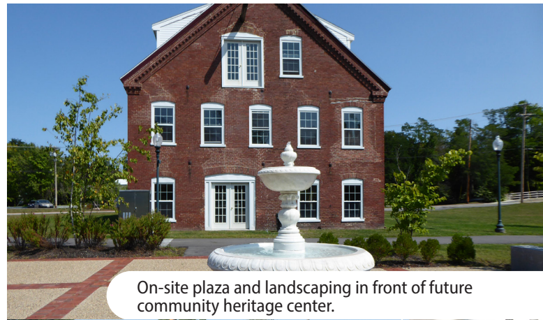
On-site plaza and landscaping in front of future community heritage center.

The cleanup and redevelopment of the 31 Water Street site is a vital part of Amesbury's city-wide redevelopment efforts. The project illustrates how Superfund Redevelopment can provide opportunities to celebrate community history and heritage while also looking to the future. Economic growth relies on local amenities and community quality of life as well as business development. The Amesbury community is successfully writing a new chapter in its long and vibrant history.