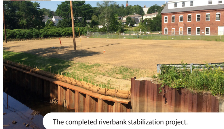
The completed riverbank stabilization project.