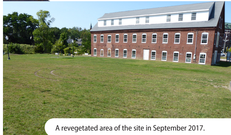
A revegetated area of the site in September 2017.