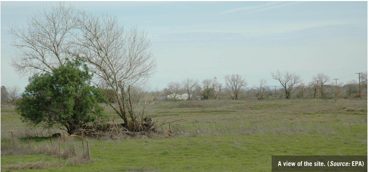
A view of the site.