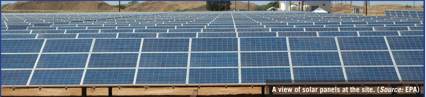
A view of solar panels at the site.

Site Location: U.S. Highway 50 and Aerojet Road, Rancho Cordova, California 95670