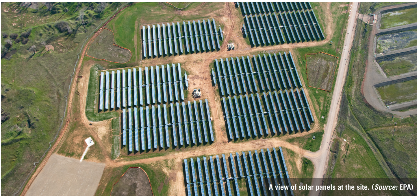
A view of solar panels at the site.