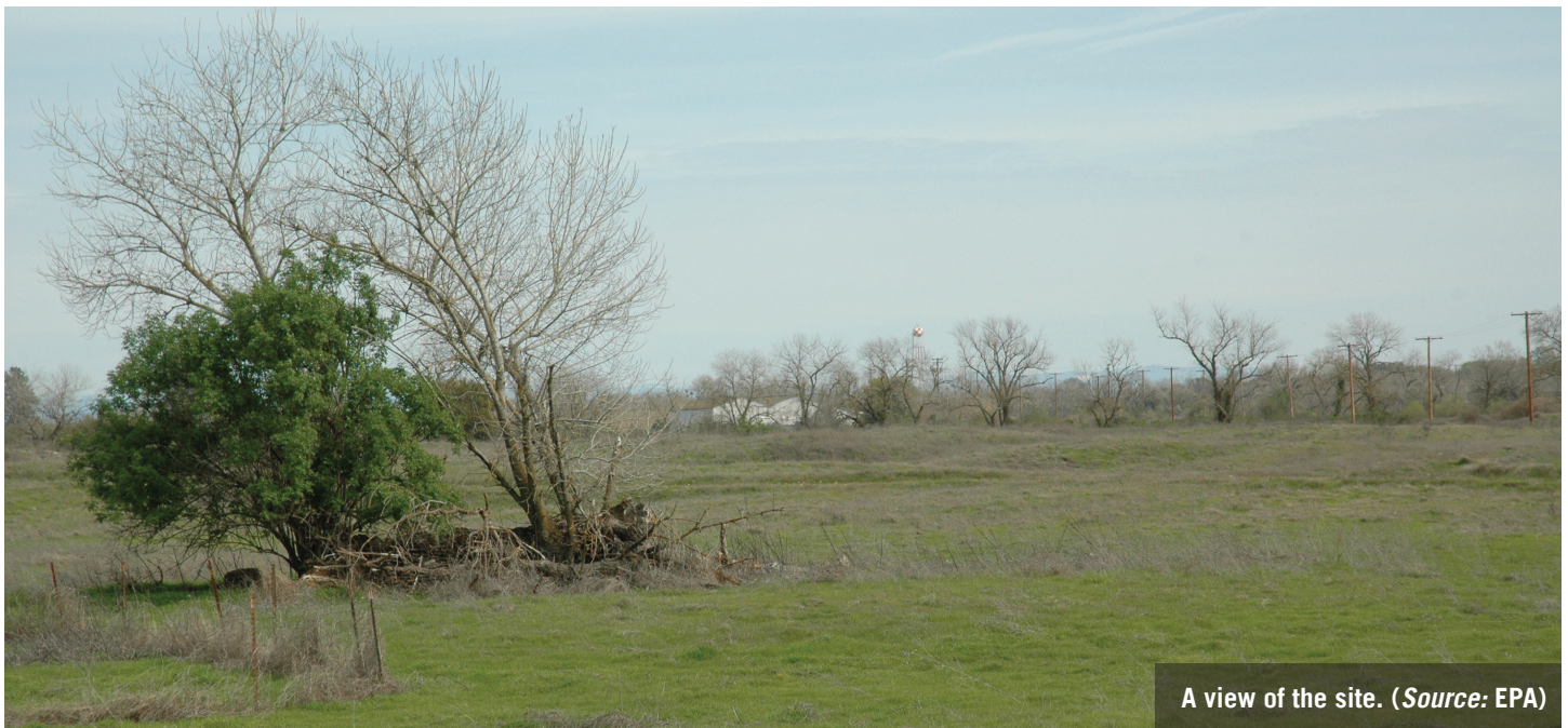
A view of the site.