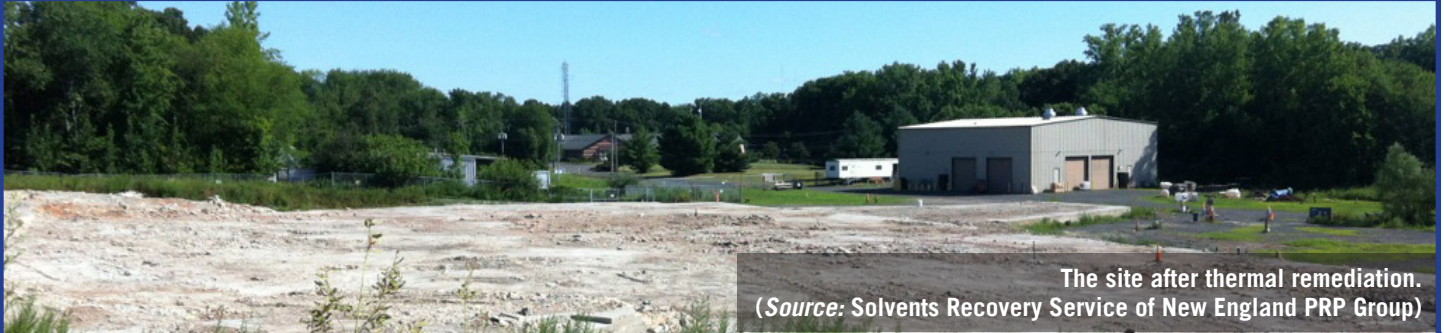
The site after thermal remediation.

Solvents Recovery Service of New England Superfund Site Southington, Connecticut