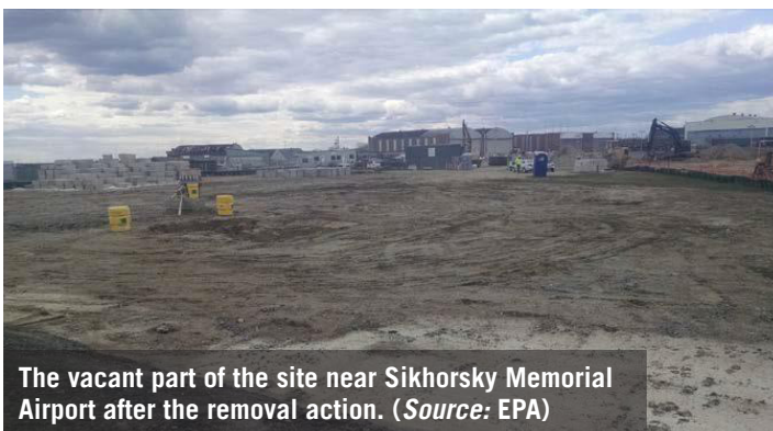
The vacant part of the site near Sikhorsky Memorial Airport after the removal action.

Today, the site is home to a commercial complex that includes Walmart, Home Depot, Webster Bank and ShopRite. The town of Stratford is working with developers on redevelopment plans for remaining areas of the site. Collaboration among stakeholders, developers, EPA, CTDEEP and USACE resulted in the protection of public health and the environment while also creating commercial redevelopment opportunities for this Connecticut community.