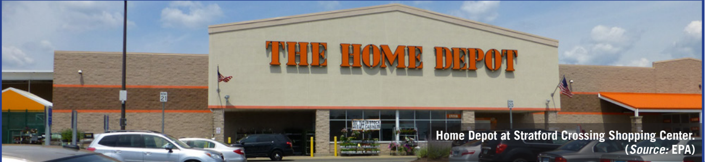
Home Depot at Stratford Crossing Shopping Center.

Raymark Industries, Inc. Superfund Site Stratford, Connecticut