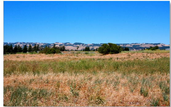
Figure 2. General setting surrounding Sola Optical.

This case study captures the on-site and community impacts of new development at the site. The site is located on the eastern outskirts of Petaluma, about an hour north of downtown San Francisco. The site is just south of route 116 and about a mile east of Highway 101. The site borders Adobe Creek, which flows into the Petaluma River; in total, it spans 35 acres. The Sola Optical Plant covered about 24 acres of the site. Surrounding land uses include mixed industrial and commercial areas, homes, natural areas, and undeveloped open space. According to the Sonoma County Economic Development Board, about 59,540 people live in Petaluma. About 496,253 people live in Sonoma County. 1