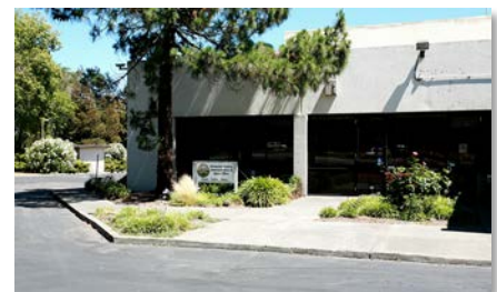
Figure 3. Petaluma Poultry's trucks and facilities at the former Sola Optical manufacturing building.