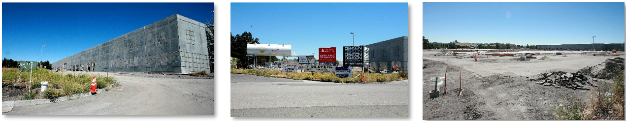
Figure 4. Views of Cader Corporate Center during construction, 2016.

The vacancy rate for warehouse space in Sonoma County is low, about 7 percent. The site's redevelopment has helped address this demand, supporting some of the highest leasing rates in the county. 4 On-site properties also generate property tax revenues that support local government and public services. During the 2014-2015 fiscal year, on-site properties generated $158,338 in local property taxes. These parcels had a combined total estimated property value of over $13.7 million. 5