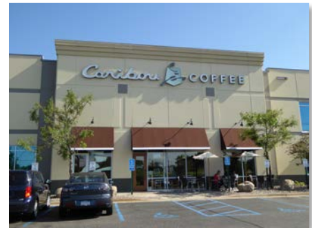
Figure 6: Caribou Coffee's on site retail location.

A distributor of landscaping products and services, MTI Distributing is a wholly owned subsidiary of Toro Company, which produces landscape maintenance and irrigation equipment. 3 MTI Distributing's corporate offices are located in Building #2 at Twin Lakes Business Park, contributing over $5.6 million in annual employment income. In addition, the firm uses a steep hill that was constructed as part of the cleanup action to test landscaping equipment and pays property taxes on that land as well.