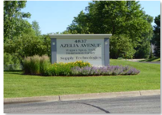
Figure 5: Business park directory for Phase 1 of redevelopment.

It was the development of the Twin Lakes Business Park that allowed the development of the fourth phase. Once prospective tenants had seen that it was possible to redevelop a formerly contaminated area, it became much easier to market these facilities as viable development opportunities. Prospective developers had previously looked past the area due to the stigma of a contaminated site, but once they had seen the results, this fourth phase had no trouble finding tenants. Currently, the facility's tenants include FujiFilm and Omnicare of Minnesota. Fujifilm manufactures camera equipment, while Omnicare is a pharmaceutical wholesaler. Together, these businesses employ about 200 people, providing nearly $24 million in annual employee income with annual sales close to $29 million. The parcel associated with the fourth phase has a present market value of $4.8 million and contributes about $211,000 in annual property tax revenues to the local government.