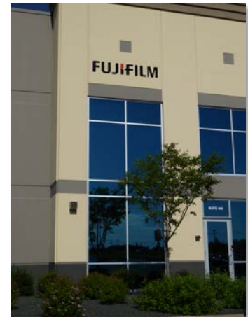
Figure 9: FujiFilm operates out of the fourth phase of development.

Omnicare is a national subsidiary of CVS Health Corporation and specializes in a broad array of pharmacy-related services to long-term care facilities and to other customers in the health care environment. This branch provides nearly $19.8 million in annual employment income. Annual sales in 2015 exceeded $23.2 million.