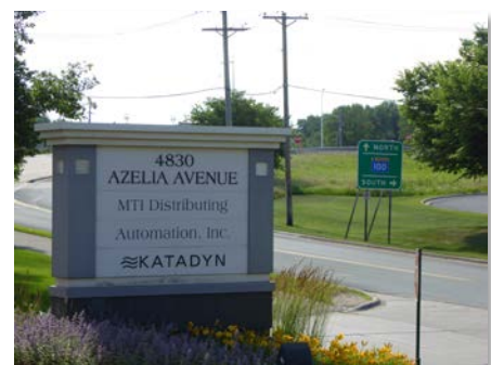
Figure 8: Business directory sign for businesses in Phase I and II.