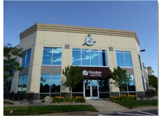
Figure 1: Caribou Coffee operates their corporate headquarters on site.

A legacy of contamination from 60 years of wood treating left vacant nearly 40 acres of prime property in the heart of the Minneapolis-St. Paul metropolitan area. Innovation and collaboration among the development company Hyde Development and Joslyn Manufacturing, the site’s potentially responsible party (PRP), with EPA and the Minnesota Pollution Control Agency (MPCA) resulted in the reuse of this valuable area as a busy commercial and industrial park. Today, businesses at Twin Lakes Business Park employ about 291 people and the properties that make up the business park generate over $952,000 in local property taxes. This case study explores economic revitalization, including job restoration, resulting from the cleanup and redevelopment of the Joslyn Manufacturing & Supply Co. Superfund site.