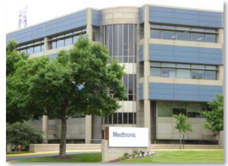
Figure 10: Medtronic, Inc. operates on the Boise Cascade site.

When Hyde Development began to develop Twin Lakes Business Park, it was the company's second redevelopment project and first redevelopment project at a Superfund site. The company's success with the project provided the experience and track record it needed to proceed with additional Superfund redevelopment projects, including a 400,000-square-foot bulk warehouse building developed on the Boise Cascade/Onan Corporation/Medtronics Inc. site in Fridley, Minnesota; an 80,000-square-foot office/showroom building on the National Lead/Taracorp/Golden Auto site in St. Louis Park, Minnesota; and a four-phase redevelopment project, called the Northern Stacks Industrial Park, at the Naval Industrial Reserve Ordnance Plant (NIROP) and FMC Fridley sites, also in Fridley. Construction is now complete at the Boise Cascade/Onan Corporation/Medtronics Inc. site and four companies operate on site, including Cummins Power Generation, Inc., Hagemeyer North America, Inc., Medtronic, Inc., and Murphy Warehouse Company. Phases I and II are complete at the Northern Stacks park, while Phase III and Phase IV are still under construction.