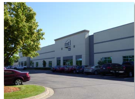
Figure 7: MTI Distributing's corporate headquarters.