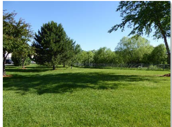
Figure 3: Green areas around storm water retention ponds.

Joslyn Manufacturing ceased wood-treating operations at the site in 1980 and removed process solutions from the site, disposing of them at a hazardous waste facility in 1981. In 1983, MPCA issued a Request for Response Action to the company, asking that it undertake cleanup to address the release of hazardous substances at the site. EPA listed the site on the Superfund program's National Priorities List (NPL) in 1984; through an agreement with EPA, MPCA continued to oversee the site's cleanup. Site cleanup began in 1988 with activities that included the excavation, treatment and disposal of contaminated soil in a hazardous waste landfill. Additional contaminated soils were treated and disposed of on site. The company installed a pump-and-treat system to clean up site groundwater in 1989. After the company finished these activities in 1996, it placed a fence around the property to protect the remedy.