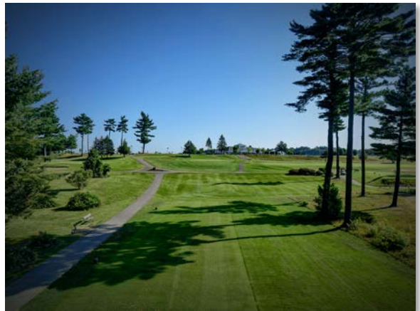
Figure 14. Pease Golf Course offers 27 holes with manicured greens, woodlands and streams.

The Air Force transferred the Pease Golf Course to the Pease Development Authority in 1991. With the addition of nine new holes, the 27-hole public course is now one of the premier courses in New Hampshire. Estimated sales at the golf course top $2 million per year, and jobs at the course produce an estimated $140,000 in annual income. The text box on the following page provides more information about the benefits of green space.