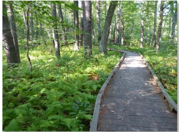
Figure 13. The Great Bay National Wildlife Refuge protects more than 1,000 acres along the seacoast for migratory birds and other wildlife.

In 1992, the Air Force transferred 1,054 acres of the site to the U.S. Fish and Wildlife Service to create the Great Bay National Wildlife Refuge. The refuge preserves one of the longest stretches of undeveloped shoreline along the bay, which is home to the state's greatest concentration of wintering black ducks and bald eagles. Every year, about 60,000 birdwatchers and other visitors come to the refuge to observe waterfowl, shorebirds, wading birds and raptors. The Benefits of Green Space text box on the next page provides more information about the benefits of green space at Superfund sites.