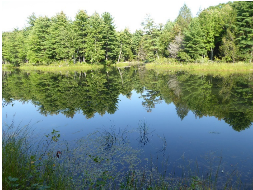
Figure 15. The Great Bay National Wildlife Refuge is a haven for migratory birds and other wildlife, and provides recreational opportunities for the community.

Parks, natural areas and scenic landscapes also have significant economic value – supporting regional economies through tourism, agriculture and other activities. Economic impacts of recreation activities include outdoor recreation spending and reduced public costs related to healthcare and infrastructure. Protected green space can also increase the property values of nearby homes by providing amenities that draw people to live and work in the community. To learn more, visit EPA's Green Infrastructure: Thinking Regionally website ( https://www.epa.gov/superfund-redevelopment-initiative/green-infrastructure-thinking-regionally ) and EPA's Smart Growth website ( https://www.epa.gov/smartgrowth ).