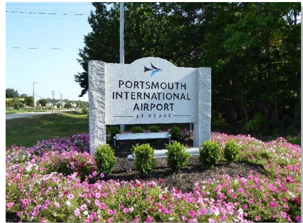
Figure 11. Portsmouth International Airport is a convenient regional option for travelers.