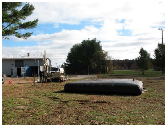
Figure 3. Bioremediation injection at the site.

The effort to redevelop a closed military base and Superfund site faced several obstacles, including contamination and liability concerns as well as the presence of many obsolete buildings. Several key actions addressed these obstacles. In 1990, the Air Force, EPA and NHDES signed a Federal Facilities Agreement, laying out each party's responsibilities for cleaning up the site. In addition, as part of the 1991 Defense Appropriations Act, the federal government stated that New Hampshire and any future Tradeport tenants would not be