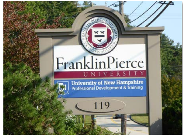
Figure 10. Franklin Pierce University offers graduate and professional studies at its Tradeport location.

A small part of the former base was retained for military use. The 157th Air Refueling Wing of the New Hampshire Air National Guard, based at Pease Air National Guard Base, provides aerial refueling capability for the Air Force. The Air National Guard serves the state and the nation during natural disasters, humanitarian operations and combat. The approximately 300 jobs at the Air National Guard Base generate nearly $21 million in estimated annual employment income.