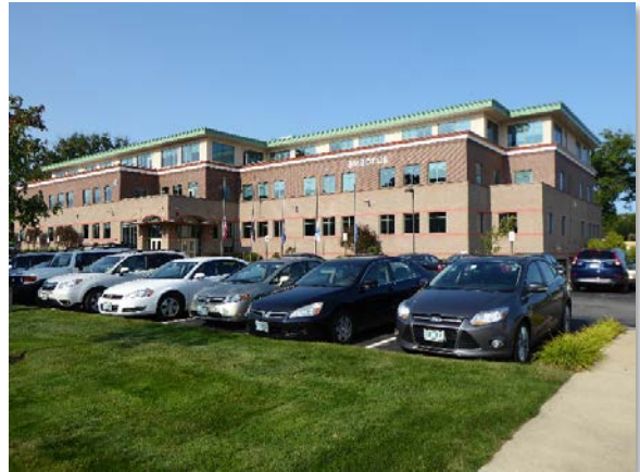
Figure 4. Pease International Tradeport is home to over 260 businesses, education facilities and government offices.

In 1991, the base was officially transferred from military to civilian control. The following year, it was re-introduced as the Pease International Tradeport. The Tradeport is now a thriving business park that hosts commercial and industrial businesses, education facilities, and government offices. Business sectors represented at the site include corporate headquarters, high-tech manufacturing, finance and insurance, publishing, telecommunications, aviation, engineering, health care, and hospitality. The sections below highlight some of the businesses active at the Tradeport.