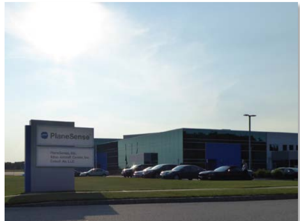
Figure 7. Private aviation provider PlaneSense is one of several companies taking advantage of the proximity of Portsmouth International Airport at the site.

Medtronic is one of the world's largest medical technology companies. Its Advanced Energy division, headquartered at the Pease International Tradeport, makes electrosurgical