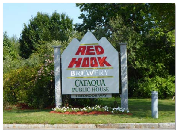
Figure 6. Seattle’s Redhook Brewery chose the Pease International Tradeport as its East Coast base.