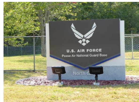
Figure 12. Pease Air National Guard Base is home to the 157th Air Refueling Wing of the New Hampshire Air National Guard.