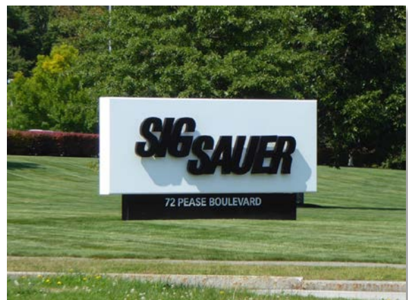
Figure 9. Firearms manufacturer Sig Sauer has its U.S. headquarters at Pease.