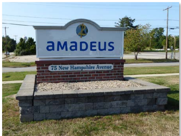
Figure 8. Amadeus provides technology services to the hotel industry from its hospitality division headquarters at the Pease Tradeport.