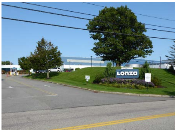
Figure 5. Pharmaceutical manufacturer Lonza Biologics has expanded its plant at the Tradeport several times.

This Seattle-based business opened its East Coast complex at Pease in 1997. In addition to the brewery, Redhook operates the Cataqua Public House and hosts events at the brewery grounds. It employs approximately 50 employees and generates nearly $2 million in annual employment income. In 2016, annual sales revenue reached nearly $33 million.