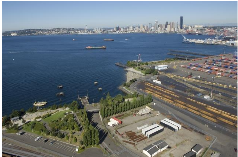
Figure 8. The portion of Jack Block Park located on the PSR site is along the shoreline toward the upper right. As a result of the marine sediments cleanup, kayakers now use the beach (upper right) as a boat launch point.

Today Terminal 5 is one of the Port’s largest container handling and storage facilities and continues to serve as the base for APL’s Global Gateway North. The terminal includes the latest generation of computerized terminal operations systems, advanced on-dock cargo transfer rail facilities, six container cranes and three container ship docking areas. Terminal crews load and unload container ships and move the cargo containers primarily on and off double-stack railcars. Trains and trucks then move the cargo to consumer markets throughout the United States. The integration of rail into terminal cargo shipping operations helped to reduce the terminal’s dependency on truck transport of ship cargo, thus lowering the Port’s overall carbon footprint and improving local air quality. The project also led to the creation of the 5.8-acre Jack Block Park – a public park that provides pedestrian and walking trails, access to the Elliott Bay shoreline for boaters and impressive views of the Seattle skyline, Puget Sound and shipping activity at Terminal 5. Looking forward, the park will continue to serve as a unique recreational gem for Seattle residents and tourists. The combined Terminal 5/PSR site will continue to be an important employment resource for local residents and a “Green Gateway” for the efficient movement of goods from across the world to markets throughout the United States.