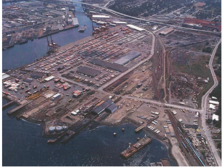
Figure 3. Terminal 5 prior to large-scale redevelopment and expansion. The PSR wood treating facility is near the bottom center.

A wood-treating facility operated at the PSR site between 1909 and 1994. The plant changed over time from a small facility into a large-scale production facility supplying regional treated wood product needs. During the years of operation, the facility released creosote and related hazardous substances in large quantities into the environment, severely contaminating the underlying soils, ground water and marine near-shore environment. On May 31, 1994, EPA placed the PSR site on the Superfund program's National Priorities List. The PSR site is one of four Superfund sites in south Elliott Bay and adjacent waterways, including the Lockheed West Seattle, Harbor Island and the Lower Duwamish Waterway sites.