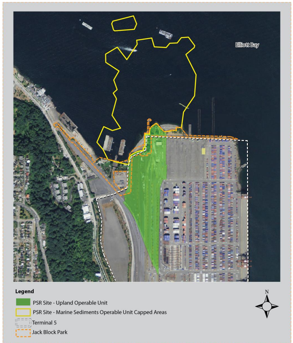
Figure 2. The PSR site, Terminal 5 and Jack Block Park

A rail-barge cargo loading dock, the west portion of Jack Block Park and additional intermodal service and general freight rail lines border the Upland Operable Unit to the west. Important urban transportation routes, Harbor Avenue Southwest and Southwest Spokane Street, extend west and south of Terminal 5, respectively. Commercial and residential areas are present west and southwest of Terminal 5 and the Upland Operable Unit.