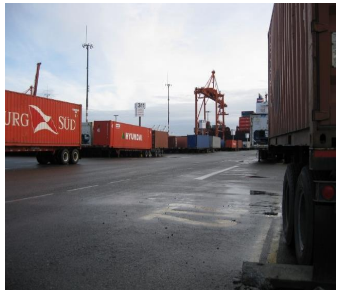
Figure 6. Cargo transfer operations at Terminal 5.

EPA's plan included dredging 10,000 cubic yards of contaminated sediment to ensure continued navigational access in the area, and removing 800 derelict creosote-treated pilings remaining as former PSR in-water structures, followed by placing and monitoring sediment caps over 58 acres of remaining contaminated sediment. EPA completed these cleanup efforts in 2005. The Port currently performs operation and maintenance activities across the asphalt cap of the site to maintain the remedy. It continues to use the southern part of the Upland Operable Unit as part of the Terminal 5's ship-to-rail cargo transfer area and maintains the northern part of the area as part of Jack Block Park. According to Port Environmental and Planning staff member George Blomberg, "Without rail access [on PSR's property], Terminal 5 would not have been a success to the degree it is now."