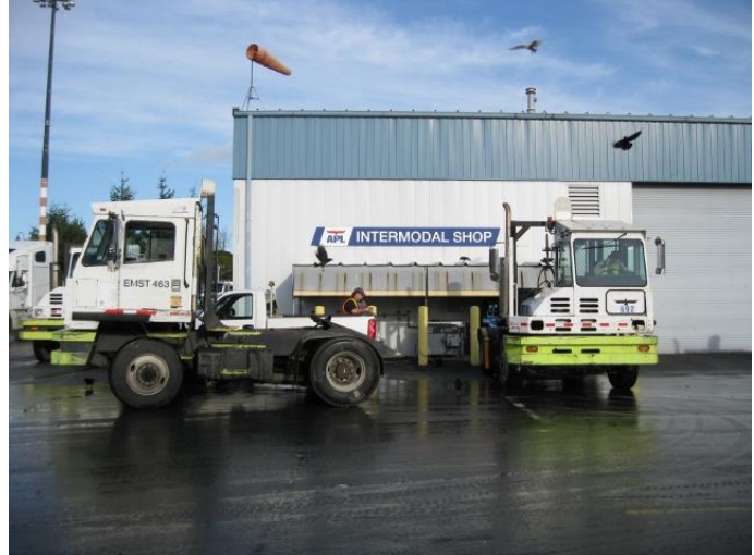
Figure 7. Terminal 5 maintenance building, located at the center portion of the PSR site's Upland Operable Unit.

Cargo terminal activity requires the involvement of many companies and organizations. In addition to cargo handling, the movement of goods involves railroad and trucking companies, transportation coordination firms, shipping operations and maintenance companies, and the coordinated efforts of local, state and federal government agencies. The Port provides and manages the physical marine terminal asset. However, the daily effort and oversight of agencies such as U.S. Customs and Border Protection, U.S. Coast Guard, and U.S. Department of Agriculture, together with state and city managers is essential for timely, predictable movement of large volumes of utterly diverse import and export cargo commodities.