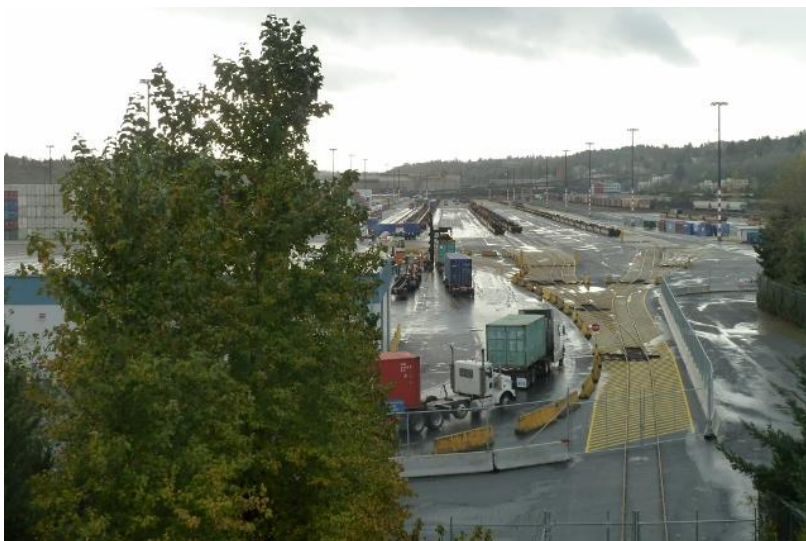
Figure 5. A large portion of the PSR site's Upland Operable Unit (shown here) was redeveloped as part of Terminal 5's cargo transfer rail yard.

In August 1994, the principal owner/operators of the wood treating facility entered into a Consent Decree with EPA. The decree resolved the liability of the Pacific Sound Resources Company's principals in exchange for all the outstanding shares of the company's stock. The court then transferred these shares to a trust and hired a trustee to liquidate all company assets for the benefit of the EPA lead cleanups. At the same time, EPA entered into a Prospective Purchaser Agreement with the Port. EPA resolved the liability of the Port in exchange for Port cleanup of the PSR site's Upland Operable Unit, at an approximate cost of $15 million. Port costs were