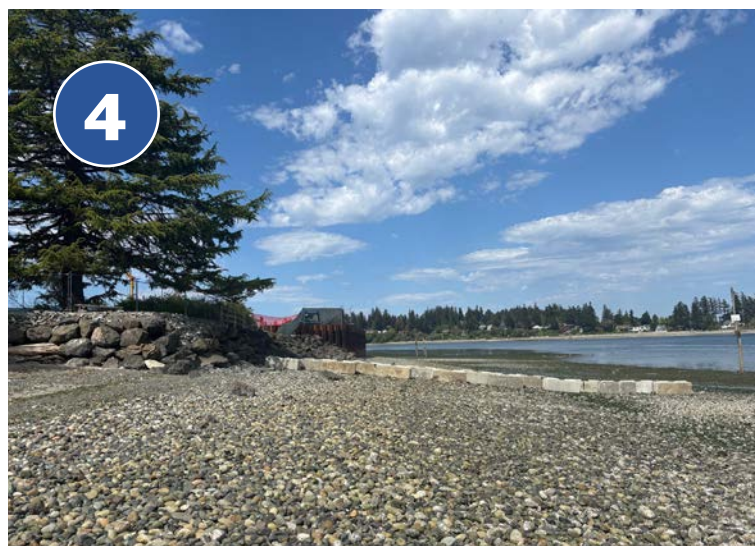
View of East Beach closure area.

Remedial Project Manager wright.bernadette@epa.gov office: (206) 553-1834 mobile: (206) 771-3106