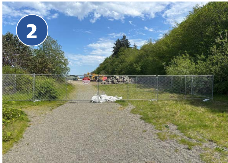
Closure area by walking trail along West Beach.