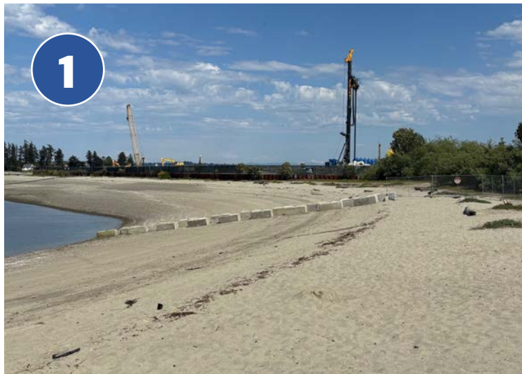
View of West Beach and West Beach closure area.