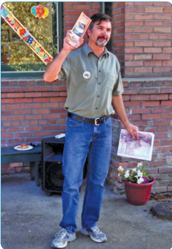
The EPA invites people be informed and involved.