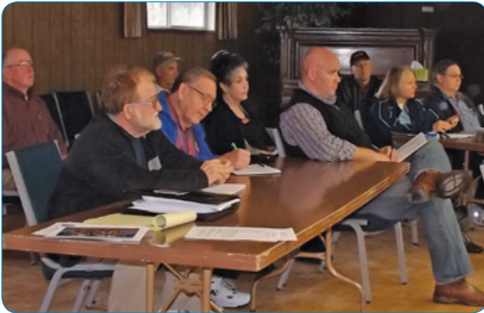
Local people discuss Cleanup issues at CCC meetings

The CCC is a group of citizens providing local input to the Basin Commission board. Meetings are open to everyone. The meetings are an opportunity to learn and provide input to the Basin Commission about the cleanup. In response to feedback and light attendance, the CCC recently started to change its meetings. The meetings are now less formal, cover topics of interest to local people, have more discussion, and are publicized well in advance. So far, the changes have been well-received.