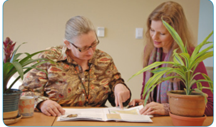
Many people shared ideas for community involvement.