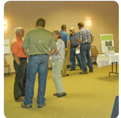
Local people participate in the cleanup process