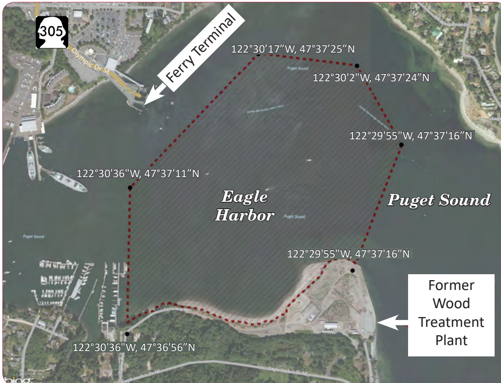
The "Regulated Navigation Area" within Eagle Harbor. Boaters are prohibited from anchoring, dredging, and other activities within its boundaries.

Anchoring is prohibited over a large area in the eastern part of Eagle Harbor. The map shows the boundaries of the "Regulated Navigation Area."