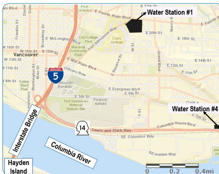
Map of WS1 and WS4 - Map shows the location of the Vancouver Water Station #1 (WS1) and #4 (WS4) Superfund Sites in Vancouver, WA.

During routine monitoring in 1988, the City of Vancouver discovered the presence of tetrachloroethylene (PCE) in the water at WS1 and WS4 and immediately modified pumping rates to protect public health. PCE is a contaminant that may harm the nervous system, liver, kidneys, reproductive system and also may increase the risk of developing cancer. In 1992, EPA established a Maximum Contaminant Level (MCL), an enforceable drinking water standard, for PCE of 5 parts per billion.