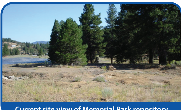
Current site view of Memorial Park repository