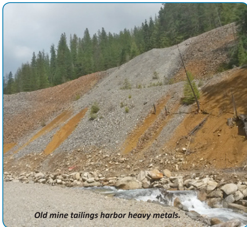
Old mine tailings harbor heavy metals.

Cleaning up the old Success Mine will protect the local ecology and people downstream.